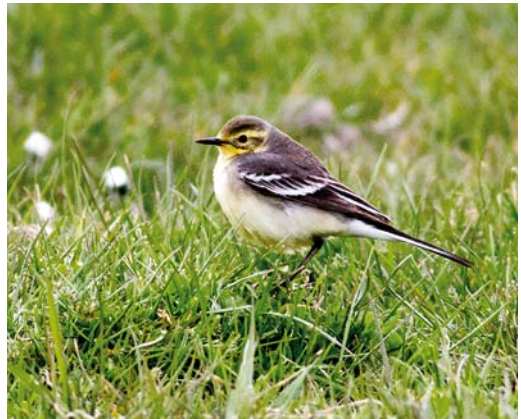
663 Blyth's Pipit / Mongoolse Pieper Anthus godlewskii , Crezéepolder, Ridderkerk, Zuid-Holland, 1 November 2015 (Karel Hoogteyling) 664 Eastern Black-eared Wheatear / Oostelijke Blonde Tapuit Oenanthe melanoleuca , male, Coepelduynen, Noordwijk, 10 June 2015 (René van Rossum) 665 Black-throated Thrush / Zwartkeellijster Turdus atrogularis , female, Loodsmansduin, Texel, Noord-Holland, 17 October 2015 (Debby Doodeman) 666 Citrine Wagtail / Citroenkwikstaart Motacilla citreola , female, Noordervroon, Westkapelle, Zeeland, 19 April 2015 (Thomas Luiten)

Holland, adult, ringed, photographed (R van der Vliet, J Valkenburg); 4 November, Kobbenduinen, Schiermonnikoog, Friesland, photographed (W M van der Schot, F Padmos).