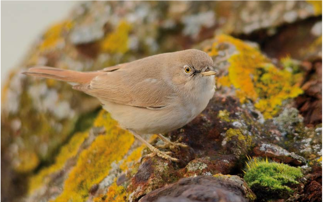
655 Asian Desert Warbler / Woestijngrasmus Sylvia nana , West-Terschelling, Terschelling, Friesland, 16 November 2015 ( John van der Graaf ) 656 Red-tailed Shrike / Turkestaanse Klauwier Lanius phoenicuroides , first-year, Noordhollands Duinreservaat, Castricum, Noord-Holland, 13 November 2014 ( Tim van der Meer ) 657 Kleine Spotvogel / Booted Warbler Iduna caligata , first-year, Noordhollands Duinreservaat, Castricum, Noord-Holland, 23 August 2015 ( Leo P Heemskerck )