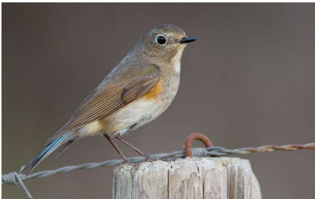
659 Siberian Stonechat / Aziatische Roodborsttapuit Saxicola maurus maurus , first-year male, Tweede Maasvlakte, Zuid-Holland, 26 September 2015 (Albert Molenaar) 660 Red-flanked Bluetail / Blauwstaart Tarsiger cyanurus , Coepelduynen, Noordwijk, Zuid-Holland, 10 April 2015 (Co van der Wardt)