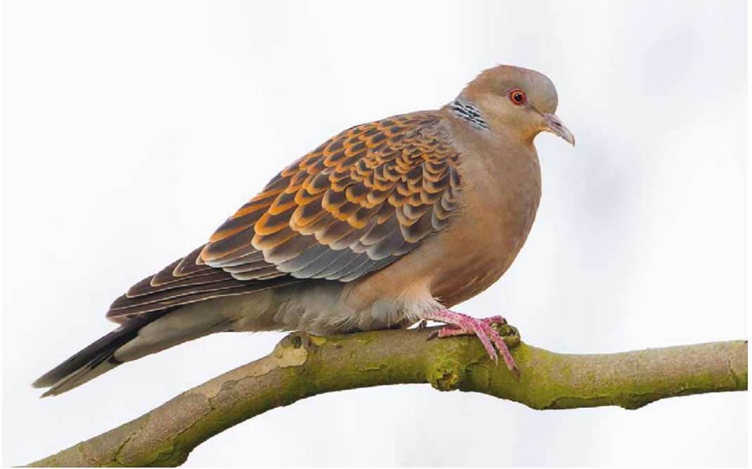
644 Oriental Turtle Dove / Oosterse Tortel Streptopelia orientalis , Vlaardingen, Zuid-Holland, 5 January 2015 (Co van der Wardt) 645 Pallid Swift / Vale Gierzwaluw Apud pallidus , first-year, IJmuiden, Noord-Holland, 8 November 2015 (Jan den Hertog) 646 Great Snipe / Poelsnip Callinago media , Broekhuizen, Limburg, 25 April 2015 (Mariet Verbeek)