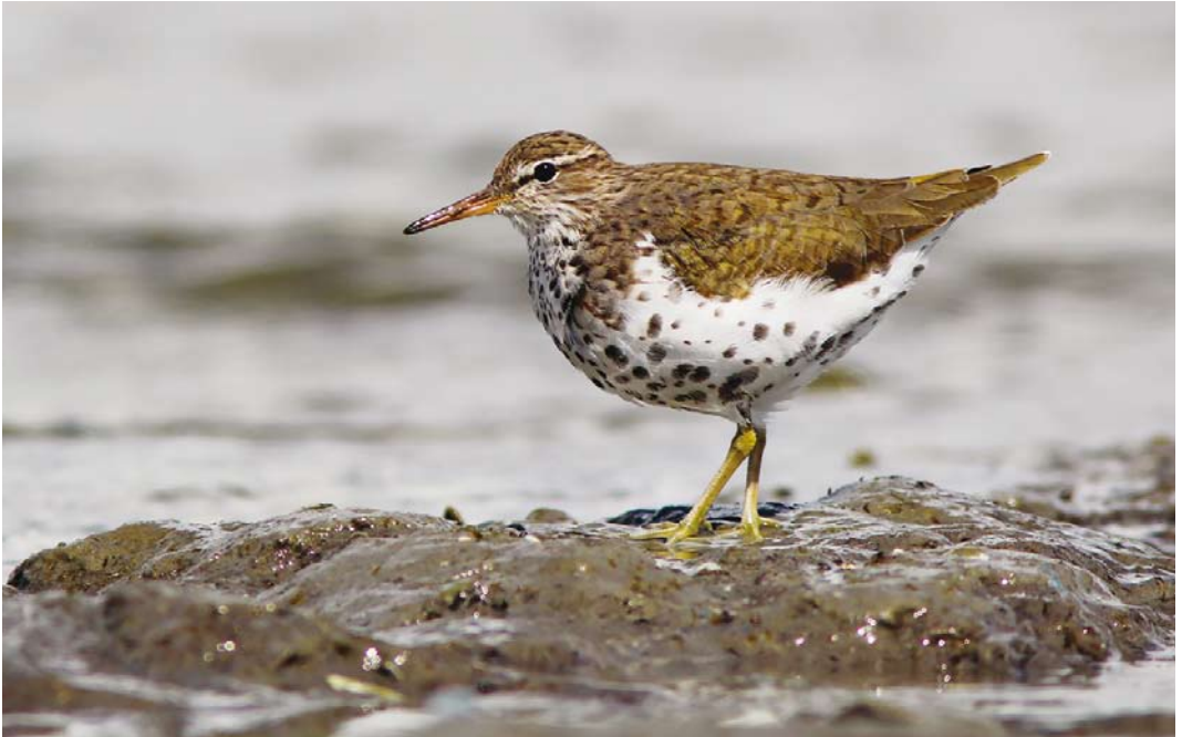
647 Spotted Sandpiper / Amerikaanse Oeverloper Actitis macularia , second calendar-year, Medemblik, Noord-Holland, 28 April 2015