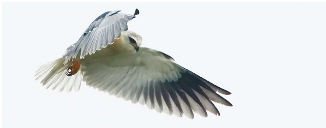
653 Black-winged Kite / Grijze Wouw Elanus caeruleus , juveniel, Maashorst, Noord-Brabant, 4 August 2015 (Michel Veldt)

ond calendar-year, photographed (M van Kleinwee). 2014 26 September, Strand Berkheide, Katwijk, Zuid-Holland, first calendar-year, wearing colour-ring, photographed (E Schouten via B van der Burg).