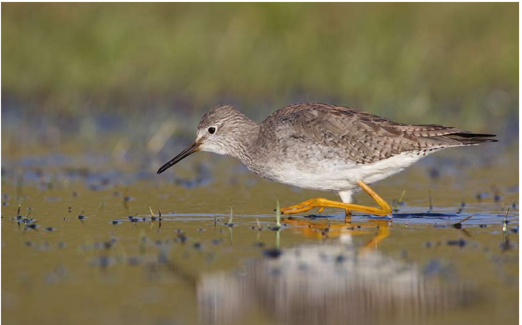
648 Lesser Yellowlegs / Kleine Geelpootruiter Tringa flavipes , Schokland, Flevoland, 27 February 2015