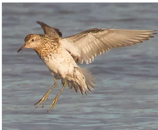
649 American Golden Plover / Amerikaanse Goudplevier Pluvialis dominica , Polder Breebaart, Groningen, 16 May 2015 (Dušan M Brinkhuizen) 650 Little Bustard / Kleine Trap Tetrax tetrax , first-winter, Polder Arkemheen, Nijkerk, Gelderland, 24 January 2015 (Alex Bos) 651 Thayer's Gull / Thayers Meeuw Larus thayeri , second calendar-year, Egmond aan Zee, Noord-Holland, 12 April 2015 (Jan van der Laan) 652 Sharp-tailed Sandpiper / Siberische Strandloper Calidris acuminata , adult, Camperduin, Noord-Holland, 7 September 2015 (Mattias Hofstede)