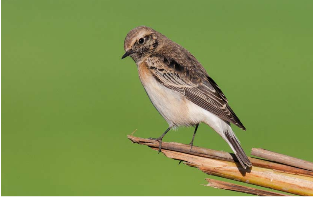
586 Pied Wheatear / Bonte Tapuit Oenanthe pleschanka , first-year male, Polder Groenendijk, Zoeterwoude, Zuid-Holland, 13 November 2014 587 Isabelline Wheatear / Izabeltapuit Oenanthe isabellina , Missouriweg, Maasvlakte, Zuid-Holland, 28 September 2014 588 Daurian Shrike / Daurische Klauwier Lanius isabellinus , first-year, Wimmenummerduinen, Egmond aan Zee, Noord-Holland, 18 October 2014