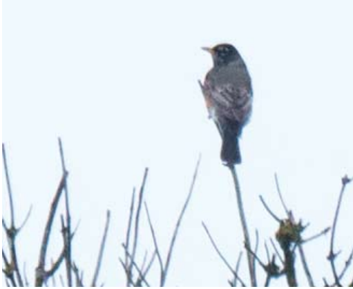
591 Roodborstlijster / American Robin Turdus migratorius , mannetje, Noordhollands Duinreservaat, Heemskerk, Noord-Holland, 27 April 2014 (Arnoud B van den Berg)

cies is no longer considered since 1 January 1993 but the CDNA still welcomes reports from before this date.