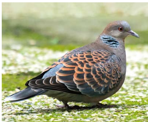
566 Green-winged Teal / Amerikaanse Wintertaling Anas carolinensis , male, Dijkmanshuizen, Texel, Noord-Holland, 10 March 2014 (Eric Menkveld) 567 Squacco Heron / Ralreiger Ardeola ralloides , Hilversumse Bovenmeent, Noord-Holland, 7 June 2014 (Rob Half) 568 Caspian Plover / Kaspische Plevier Charadrius asiaticus , first-winter, Wissenkerke, Zeeland, 24 January 2014 (Arnoud B van den Berg) 569 Oriental Turtle Dove / Oosterse Tortel Streptopelia orientalis , Vlaardingen, Zuid-Holland, 5 January 2015 (Arnoud B van den Berg)

merlie en Spaarnwoude , Noord-Holland, adult male.