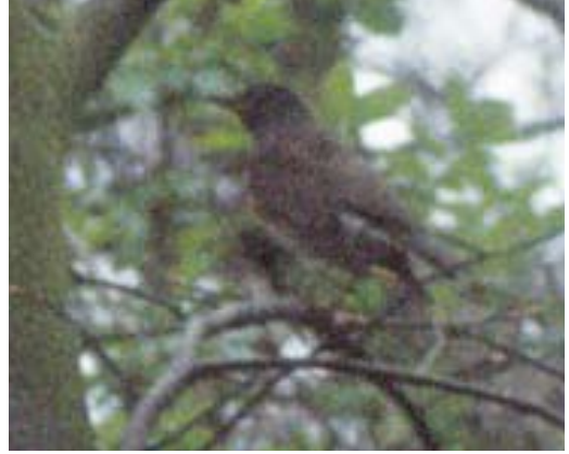
592 Eyebrowed Thrush / Vale Lijster Turdus obscurus , male, Amsterdamse Bos, Amstelveen, Noord-Holland, 24 April 1977

1974 13-21 April, Voorstreek, Schiermonnikoog , Fries-