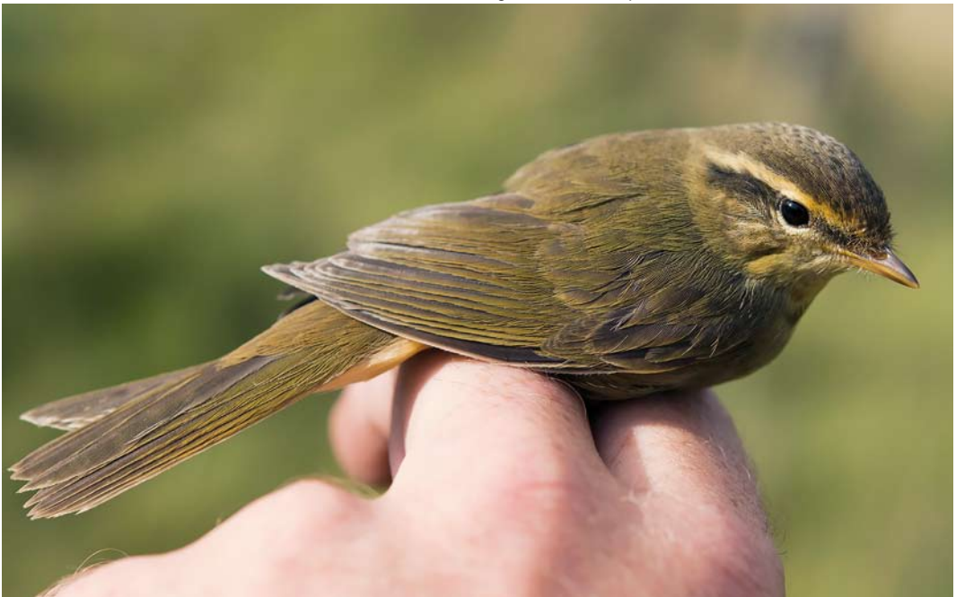
582 Radde's Warbler / Raddes Boszanger Phylloscopus schwarzi , Bloemendaal, Noord-Holland, 11 October 2014