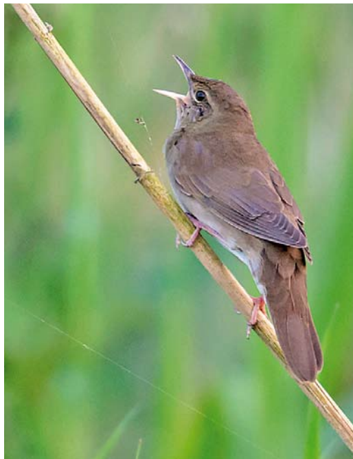
583 Booted Warbler / Kleine Spotvogel Iduna caligata , Nieuwe Stuifdijk, Maasvlakte, Zuid-Holland, 17 September 2014 584 River Warbler / Kerkelzanger Locustella fluviatilis , Dordtse Biesbosch, Zuid-Holland, 25 May 2014 585 African Desert Warbler / Afrikaanse Woestijngrasmus Sylvia deserti , Polder Gnephoek, Alphen aan den Rijn, Zuid-Holland, 29 November 2014