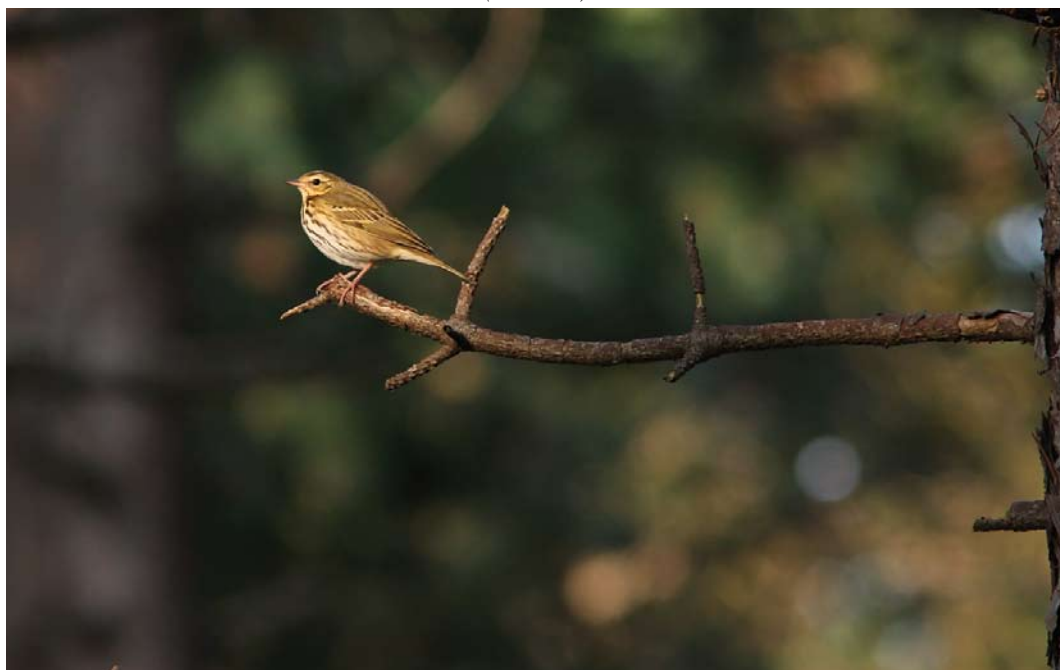
590 Olive-backed Pipit / Siberische Boompieper Anthus hodgsoni , Vlieland, Friesland, 4 October 2014