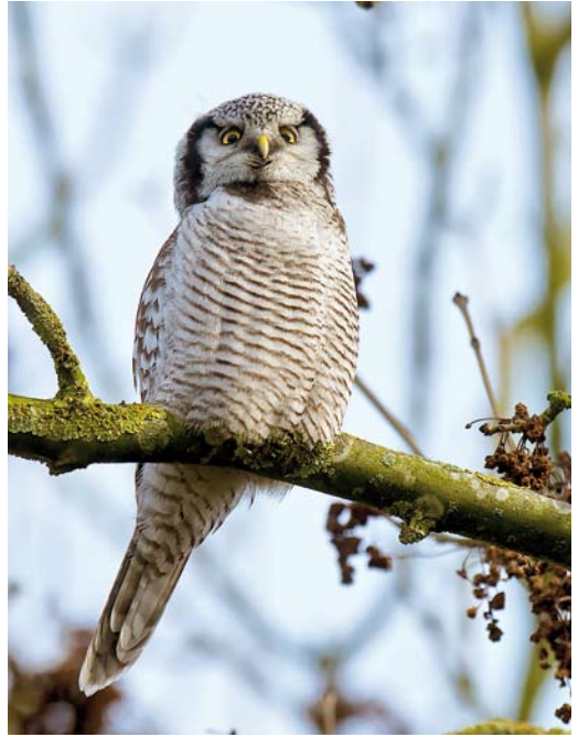
574 Eurasian Pygmy Owl / Dwerguil Glaucidium passerinum , Oostermaet, Lettele, Overijssel, 17 January 2014 (Arnoud B van den Berg) 575 Northern Hawk-Owl / Sperweruil Surnia ulula , Zwolle, Overijssel, 6 February 2014 (Arnoud B van den Berg) 576 Snowy Owl / Sneeuwuil Bubo scandiacus , first-winter female, Vlieland, Friesland, 2 February 2014 (Martin van der Schalk)