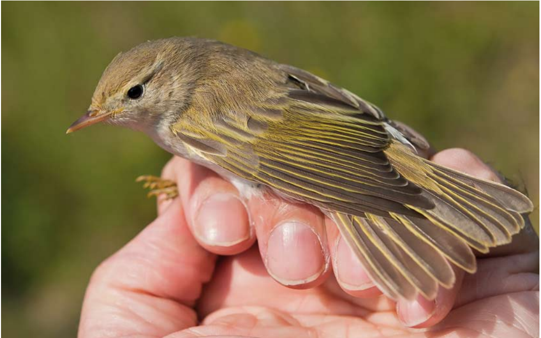
581 Western Bonelli's Warbler / Bergfluiters Phylloscopus bonelli , Bloemendaal, Noord-Holland, 4 September 2014