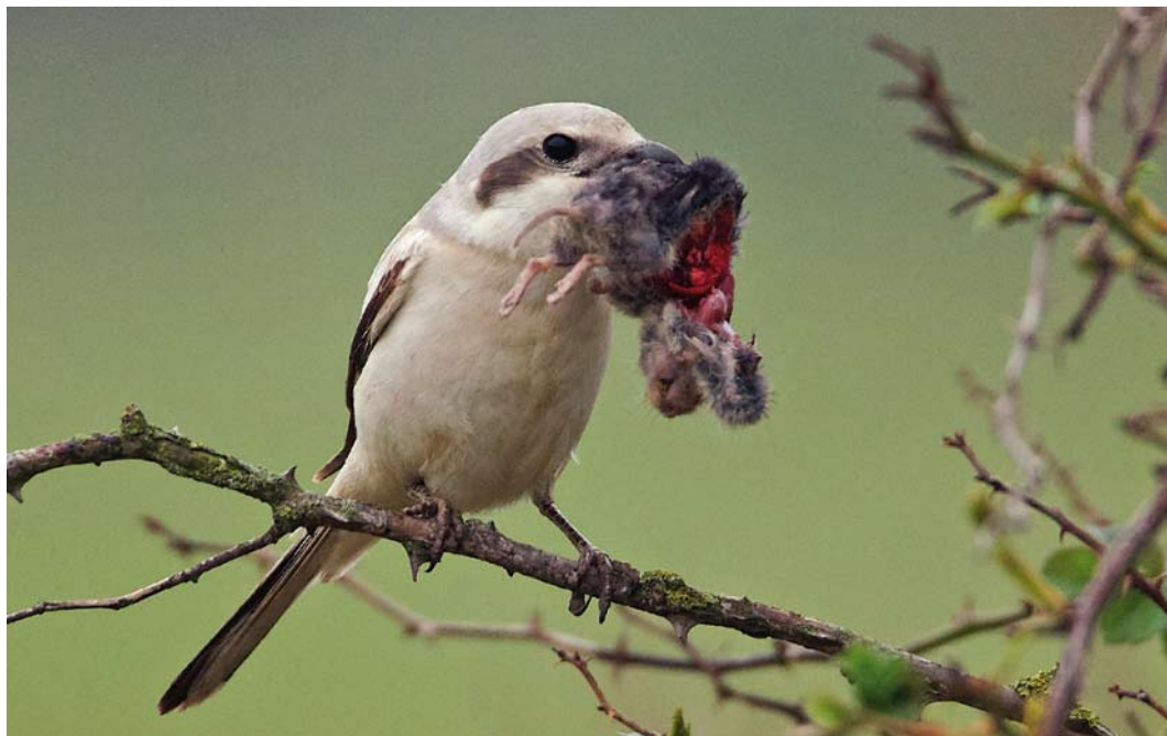
589 Steppe Grey Shrike / Steppeklaapekster Lanius lahtora pallidirostris , second calendar-year, Slag Maasmond, Maasvlakte, Zuid-Holland, 30 April 2014 (Martin van der Schalk)