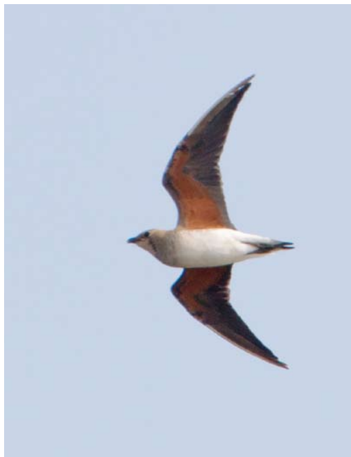
571 White-tailed Lapwing / Witstaartkievit Vanellus leucurus , De Nollen, Den Helder, Noord-Holland, 28 April 2014 572 Oriental Pratincole / Oosterse Vorkstaartplevier Glareola maldivarum , adult, Stinkgat, Sint Philipsland, Zeeland, 8 September 2014 573 Lesser Yellowlegs / Kleine Geelpootruiter Tringa flavipes , Vatrop, Noord-Holland, 14 January 2014