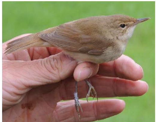
506 Two-barred Warbler / Swinhoes Boszanger Phylloscopus plumbeitarsus , first-winter, Kamperhoek, Flevoland, 1 December 2013 (Vincent Legrand) 507 Sardinian Warbler / Kleine Zwartkop Sylvia melanocephala , male, Mokkebank, Friesland, 20 April 1996 (Ype Albada) 508 Western Subalpine Warbler / Westelijke Baardgrasmus Sylvia inornata , Kennemerduinen, Bloemendaal, Noord-Holland, 6 August 2013 (Arnoud B van den Berg/Vrs van Lennep) 509 Blyth's Reed Warbler / Struikrietzanger Acrocephalus dumetorum , Ooijpolder, Gelderland, 19 August 2013 (Erik van Winden)