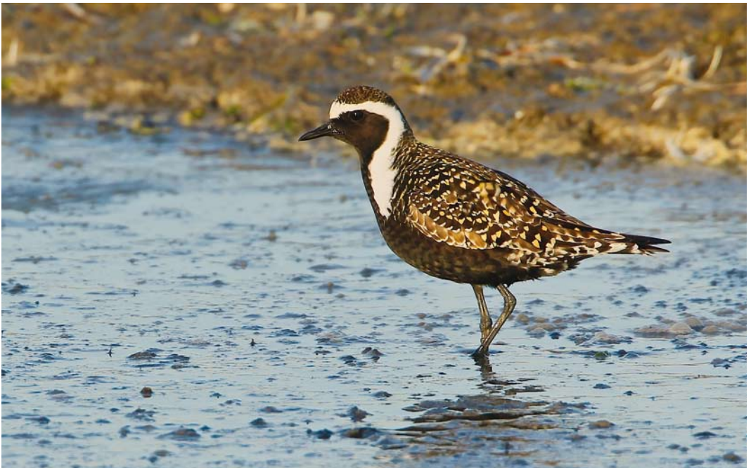
499 American Golden Plover / Amerikaanse Goudplevier Pluvialis dominica , adult summer, Camperduin, Noord-Holland, 3 June 2013 (Martin van der Schalk)