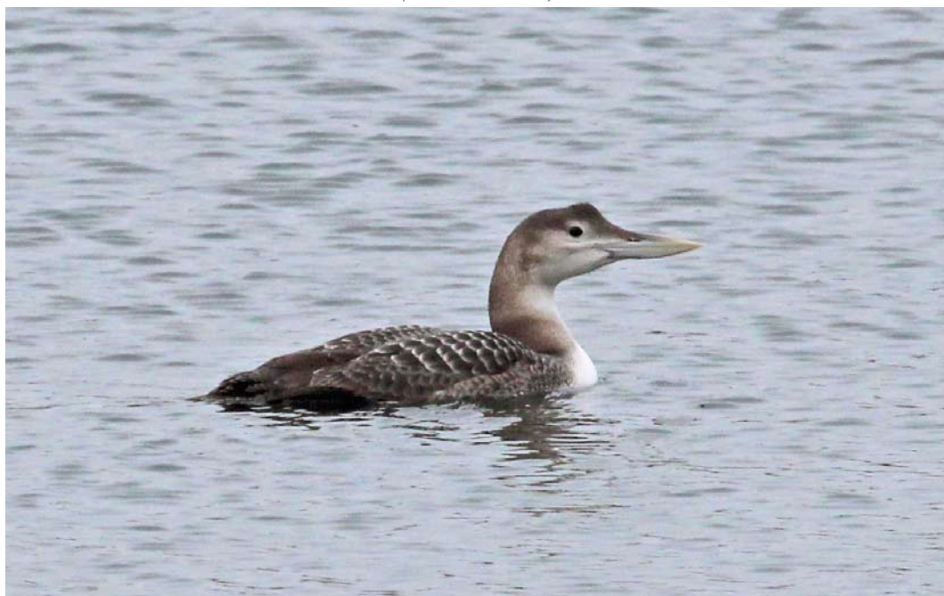
497 Yellow-billed Loon / Geelsnavelduiker Gavia adamsii , first-winter, Bommenede, Zeeland, 17 February 2013 (René den Ouden)