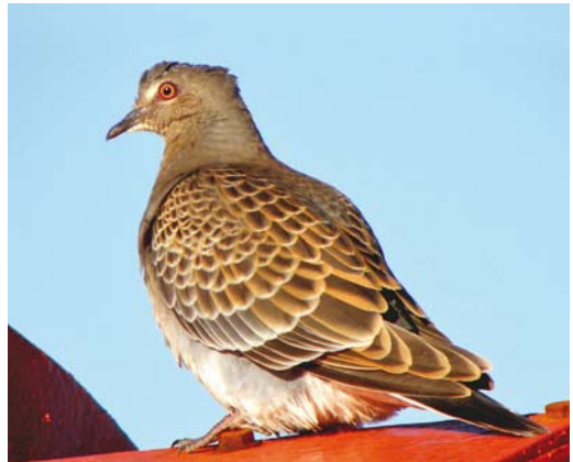
492 Baikal Teal / Siberische Taling Anas formosa , male, Meinerswijk, Gelderland, 25 December 2013 (Alex Bos) 493 Pallid Swift / Vale Gierzwaluw Apus pallidus , Neeltje Jans, Zeeland, 2 November 2013 (Alex Bos) 494-495 Rufous Turtle Dove / Meenartortel Streptopelia orientalis meena , first-year, at sea, 53°25'N 03°39'E, Continentaal Plat (north-west off Texel, Noord-Holland), 16 November 2010 (R Neumann)

2010 16 November, at sea, 53°25'N 03°39'E, Continentaal Plat (north-west off Texel, Noord-Holland), first-year, photographed (via R Neumann).