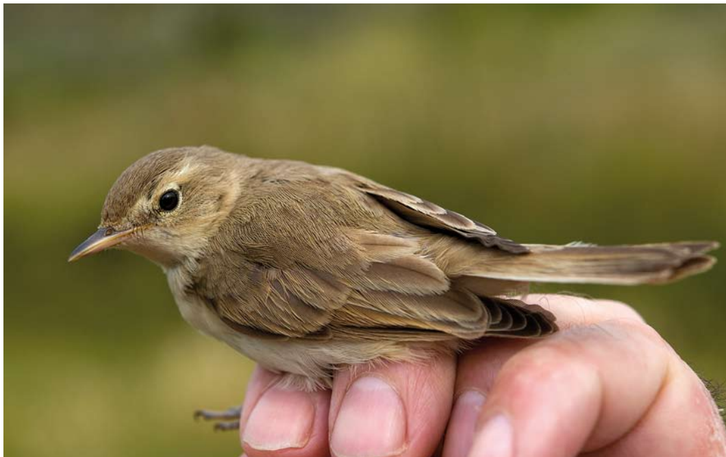
514 Booted Warbler / Kleine Spotvogel Iduna caligata , Bloemendaal, Noord-Holland, 28 August 2013