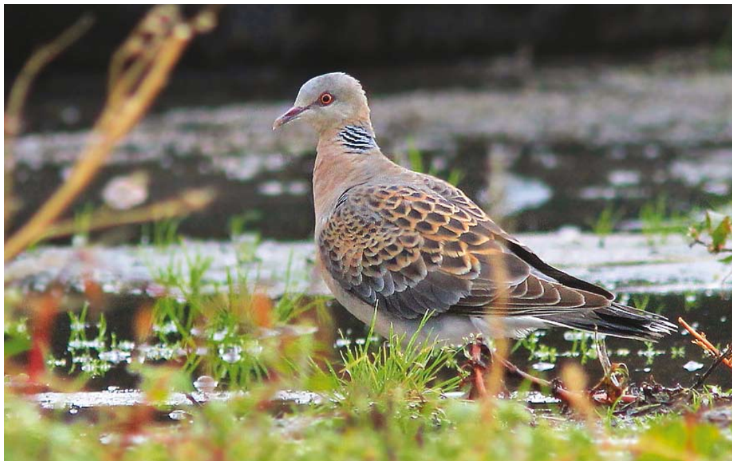
496 Rufous Turtle Dove / Meenatortel Streptopelia orientalis meena , first-year, Schiermonnikoog, Friesland, 12 October 2013 (Thijs Glastra)