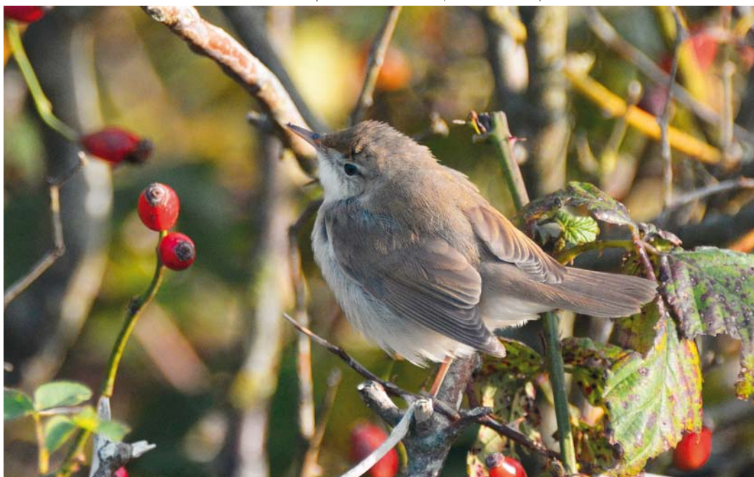
515 Blyth's Reed Warbler / Struikrietzanger Acrocephalus dumetorum , first-winter, Polder Wassenaar, Texel, Noord-Holland, 15 October 2013