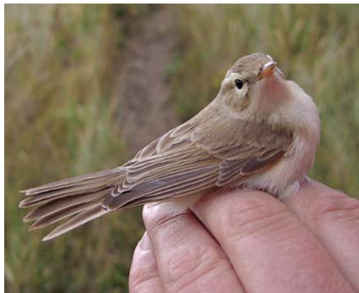
513 Booted Warbler / Kleine Spotvogel Iduna caligata , Castricum, Noord-Holland, 9 September 2013 (André J van Loon)

24 August, IJmuiden, Velsen , Noord-Holland, photographed (R Alberts); 28 August, IJmuiden, Velsen , Noord-