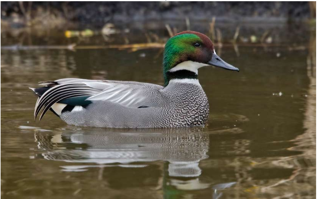
491 Falcated Duck / Bronskopeend Anas falcata , male, Spijkenisse, Zuid-Holland, 31 March 2013