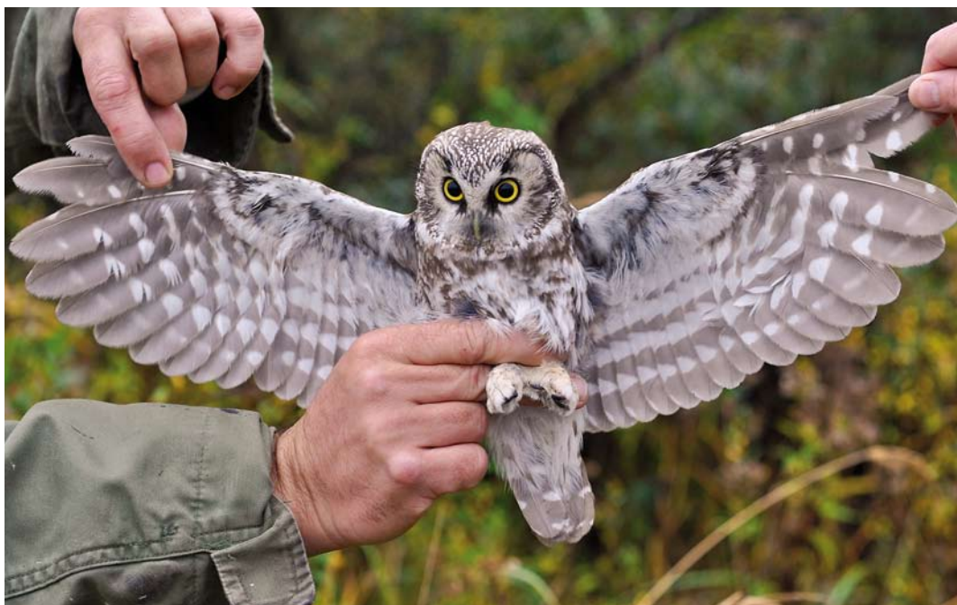
504 Boreal Owl / Ruigpootuil Aegolius funereus , Eemshaven, Groningen, 17 October 2013