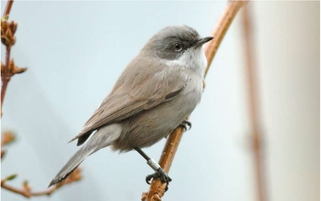
510 Desert Lesser Whitethroat / Vale Braamsluiper Sylvia althaea halimodendri , Vinkhuizen, Groningen, Groningen, 1 February 2007

been adopted by the CDNA, and are not all repeated here. In four unspecified 'subalpine warblers', vocalizations ruled out Moltoni's Warbler S subalpina (cf Wassink & CDNA 2014). The only record of Moltoni's (at Bloemendaal, Noord-Holland, on 23-26 May 1987) is under review (cf Wassink & CDNA 2014). Totals exclude birds accepted to species level.