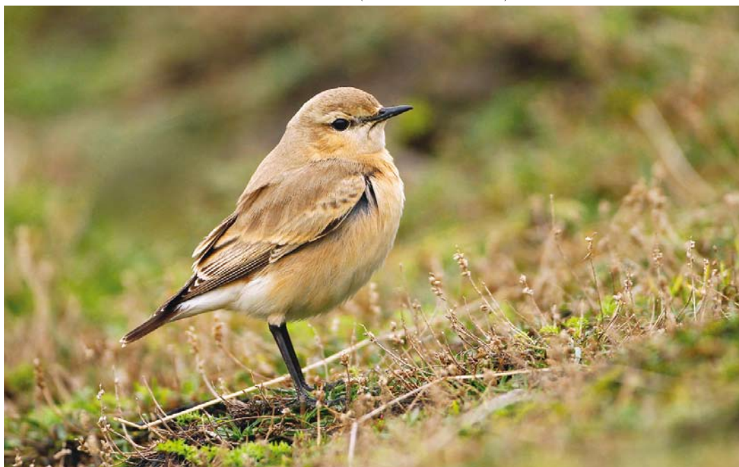
520 Isabelline Wheatear / Izabeltapuit Oenanthe isabellina , first-winter, Maasvlakte, Zuid-Holland, 1 November 2013 (Martin van der Schalk)