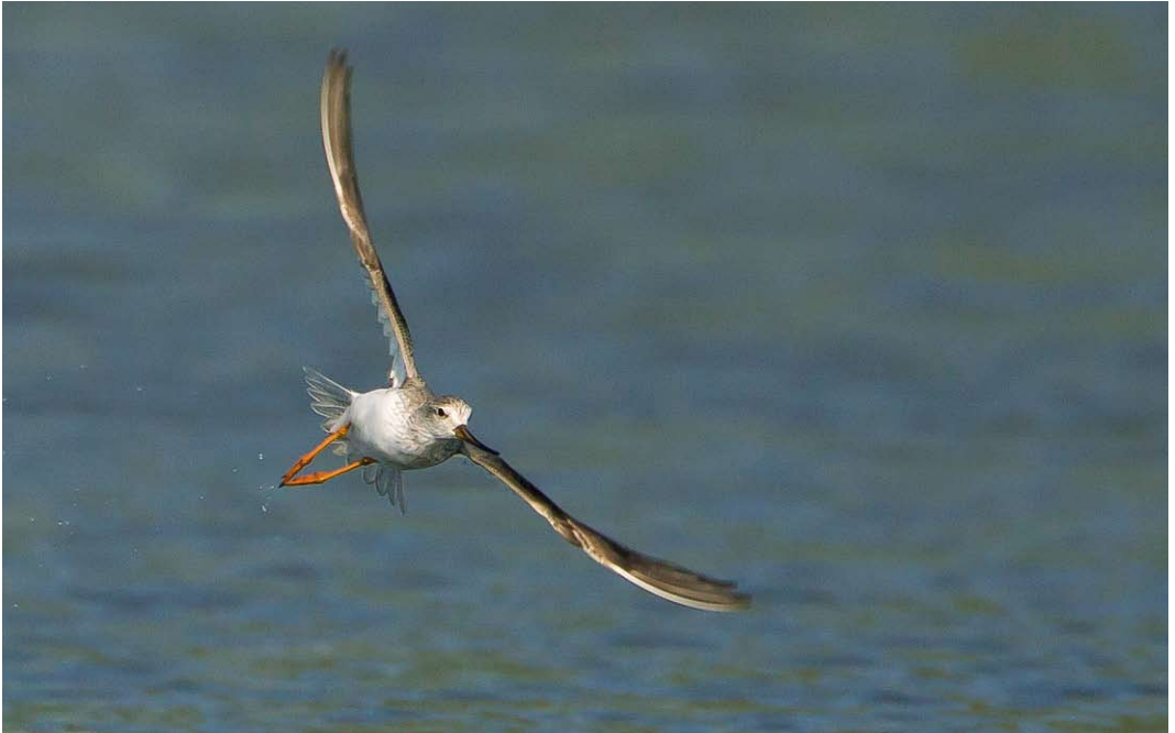
498 Terek Sandpiper / Terekruiter Xenus cinereus , male, Spaarndam-West, Noord-Holland, 28 May 2013 (Hans Brinks)