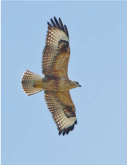
500 Long-legged Buzzard / Arendbuizerd Buteo rufinus , Maasvlakte, Zuid-Holland, 26 September 2013

summer, moulting into winter plumage, photographed, sound-recorded (P van Franeker et al; Dutch Birding 35: 354, plate 451, 2013); 3-20 November, Bantpolder, Dongeradeel, Friesland, adult winter (M Olthoff et al).