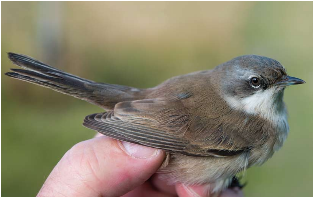
512 Siberian Lesser Whitethroat / Siberische Braamsluiper Sylvia althaea blythi , Bloemendaal, Noord-Holland, 18 October 2013 (Arnoud B van den Berg/Vrs van Lennep)