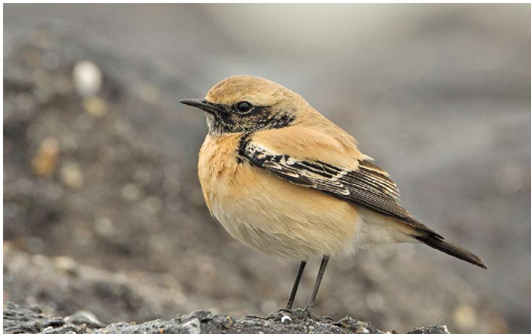
519 Desert Wheatear / Woestijntapuit Oenanthe deserti , first-winter male, Westkapelle, Zeeland, 1 November 2013 (Co van der Wardt)