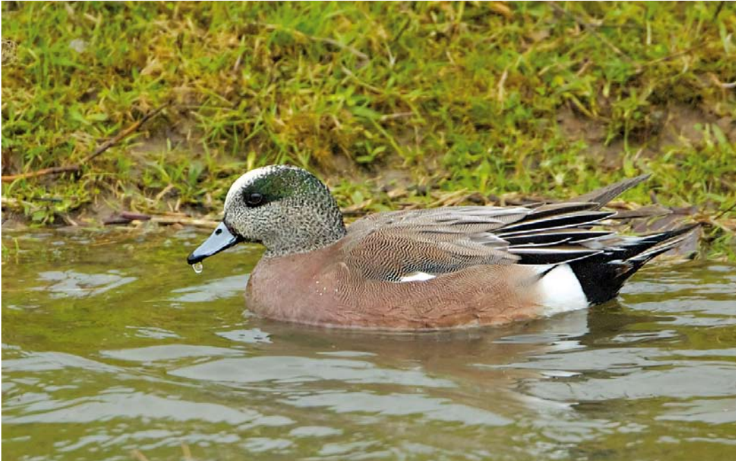
490 American Wigeon / Amerikaanse Smient, Anas americana , male, Eiland van Maurik, Gelderland, 3 February 2013