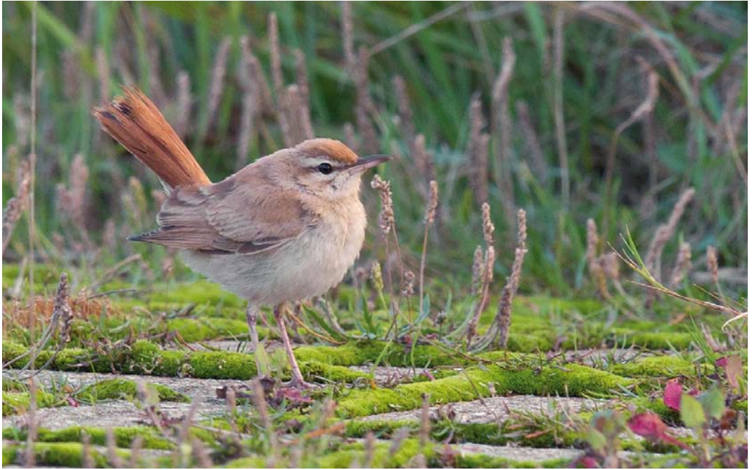
516 Western Rufous-tailed Scrub Robin / Westelijke Rosse Waaierstaart Cercotrichas galactotes galactotes , first-winter, Camperduin, Noord-Holland, 27 September 2014 ( René van Rossum ) 517 Siberian Stonechat / Aziatische Roodborsttapuit Saxicola maurus maurus , first-winter male, Robbenjager, De Cocksdorp, Texel, Noord-Holland, 10 October 2013 ( Eric Menkveld ) 518 Red-flanked Bluetail / Blauwstaart Tarsiger cyanurus , first-winter, Levensvreugd, De Cocksdorp, Texel, Noord-Holland, 15 October 2013 ( Hans Gebuis )