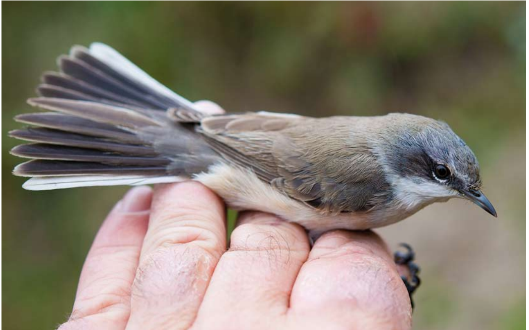
511 Siberian Lesser Whitethroat / Siberische Braamsluiper Sylvia althaea blythi , Bloemendaal, Noord-Holland, 20 October 2012