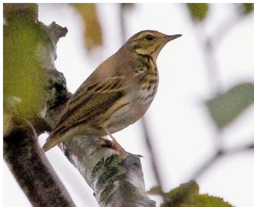
484 Olive-backed Pipit / Siberische Boompieper Anthus hodgsoni , Reddingsweg, Schiermonnikoog, Friesland, 22 October 2010