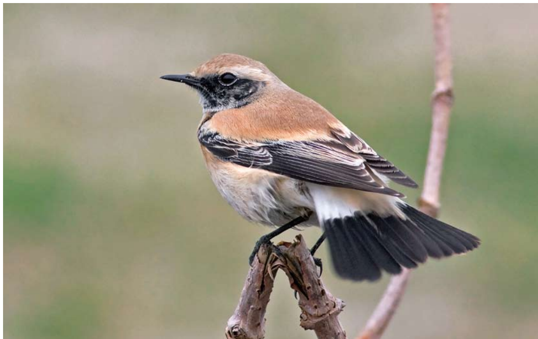
480 Desert Wheatear / Woestijntapuit Oenanthe deserti , male, Stellendam, Zuid-Holland, 5 November 2010 (Thomas Luiten)