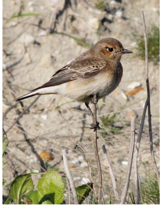
479 Pied Wheatear / Bonte Tapuit Oenanthe pleschanka , female, Westkapelle, Zeeland, 25 October 2010