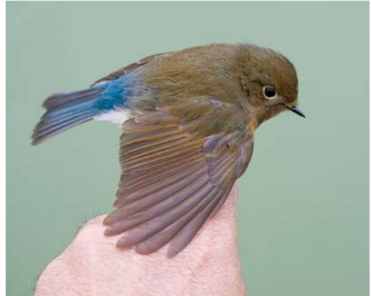
482 Red-flanked Bluetail / Blauwstaart Tarsiger cyanurus , first-year male, Kennemerduinen, Bloemendaal, Noord-Holland, Netherlands, 1 November 2010

A first-winter male on 26-28 September (also) at Oost-Vlieland (Dutch Birding 32: 431, plate 610, 2010) is still