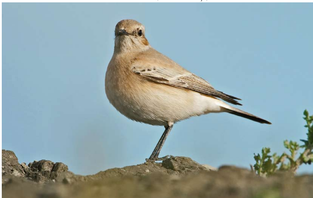
481 Desert Wheatear / Woestijntapuit Oenanthe deserti , female, Waddenzeedijk, Schiermonnikoog, Friesland, 24 October 2010 (Menno van Duijn)