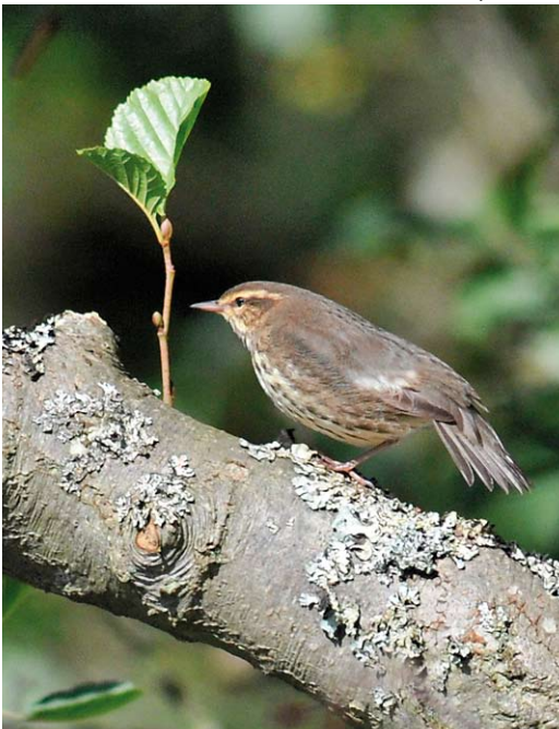
488-489 Northern Waterthrush / Noordse Waterlijster Parkesia noveboracensis , Oude Kooi, Vlieland, Friesland, 21 September 2010 (René Pop)