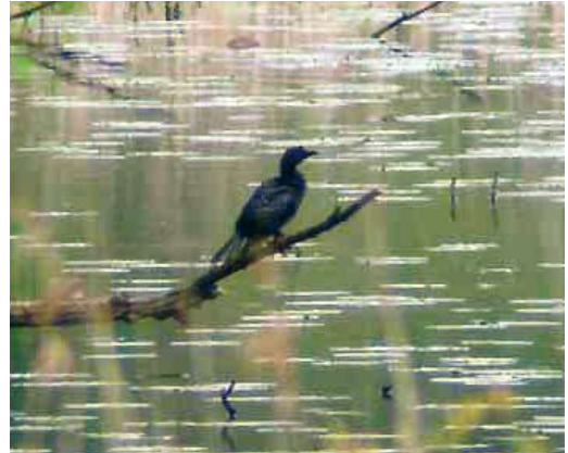
470 Pygmy Cormorant / Dwergaalscholver Phalacrocorax pygmeus , Ooijse Graaf, Ooijpolder, Gelderland, Netherlands, 12 May 2010

This is a date extension of a bird previously accepted for 25-30 April 1995 (van den Berg & Bosman 2001). This species is no longer considered since 1 January 2000 but the CDNA still welcomes reports from before this date.