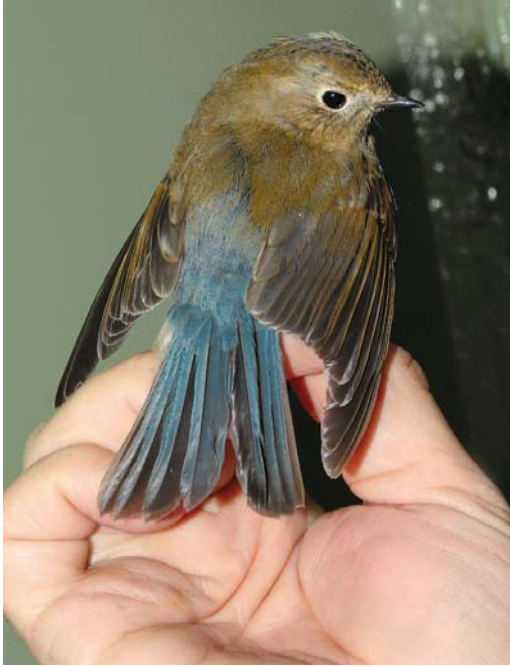
478 Red-flanked Bluetail / Blauwstaart Tarsiger cyanurus , first-year, Kennemerduinen, Bloemendaal, Noord-Holland, Netherlands, 31 October 2010