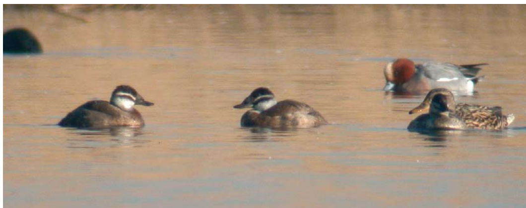
468 Surf Scoter / Brilzee-eend Melanitta perspicillata , adult male, with Common Eider / Eider Somateria mollissima , female, Horsmeertjes, Texel, Noord-Holland, 9 May 2010 469 White-headed Ducks / Witkopeenden Oxyura leucocephala , Starrevaart, Leidschendam, Zuid-Holland, 28 February 2010

bird, already accepted for the winter of 2007/08 (Ovaa et al 2009). The returning bird at Wieringermeer was first accepted for 26 December 2003 to 2 March 2004 (van der Vliet et al 2006).