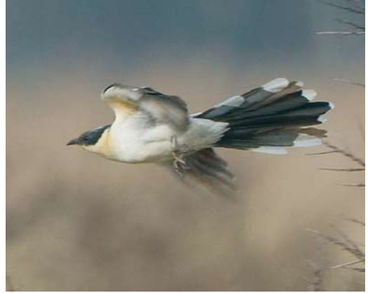
476 Great Crested Cuckoo / Kuifkoekoek Clamator glandarius , Lentevreugd, Wassenaar, Zuid-Holland, 24 March 2010

Dutch Birding 32: 272, plate 366, 2010).