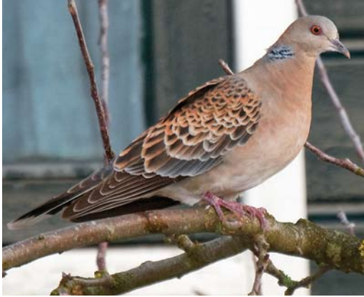
475 Rufous Turtle Dove / Meenatortel Streptopelia orientalis meena , adult, Wergea (Warga), Friesland, 31 January 2010