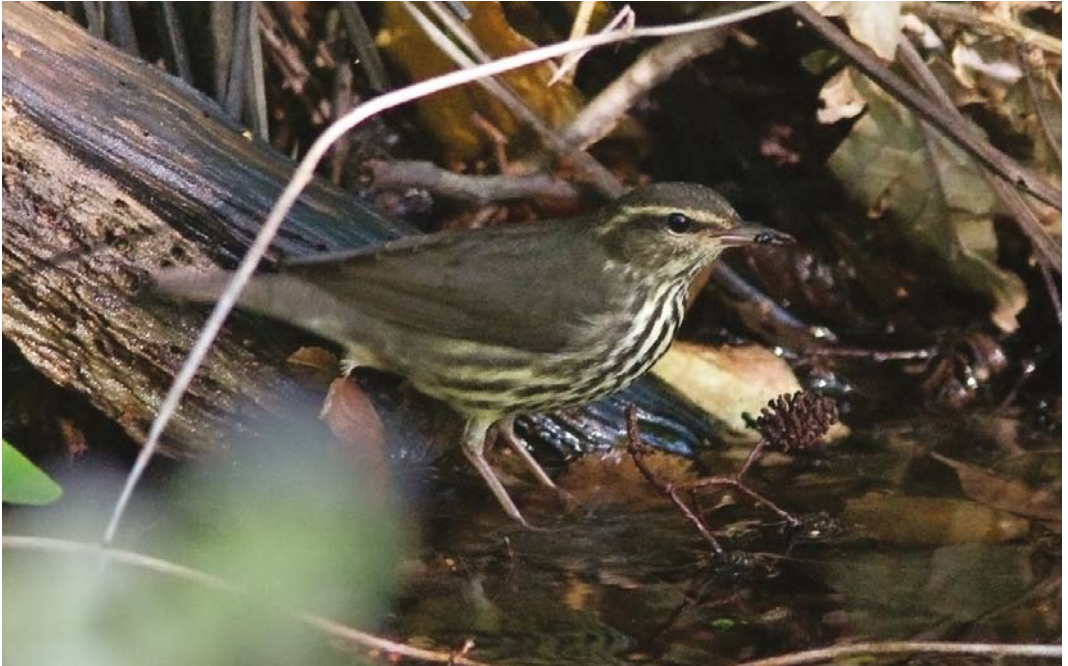
487 Northern Waterthrush / Noordse Waterlijster Parkesia noveboracensis , Oude Kooi, Vlieland, Friesland, 18 September 2010 (Arnold Meijer)