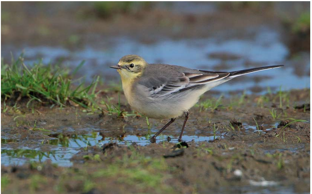
486 Citrine Wagtail / Citroenkwikstaart Motacilla citreola , Klaas Hennepoelpolder, Warmond, Zuid-Holland, 31 October 2010 ( Martin van der Schalk )