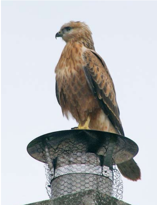
471 Long-legged Buzzard / Arendsbuizerd Buteo rufinus , juvenile, De Krim, Texel, Noord-Holland, 13 July 2010 (Nico Baas)

calendar-year, male, photographed (G Gerritsen, H Roersma, N van Brederode); 25 April, Ketelbrug, Dronten , Flevoland, second calendar-year, photographed (J Vreeman, T Janssen et al); 30 August, Alblasterwaard, Graafstroom , Zuid-Holland, second calendar-year, male, photographed (A Clements, P Bieren, A Stip).