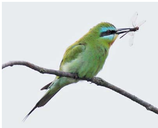
477 Blue-cheeked Bee-eater / Groene Bijeneter Merops persicus , adult, Noordhollands Duinreservaat, Castricum, Noord-Holland, 16 August 2010

A bird at De Cocksdorp, Texel, Noord-Holland, on 7 November (Dutch Birding 33: 69, plate 85, 2011) is still in circulation. The 1983 record was erroneously mentioned as a trapped bird but it was only observed in the field and not in the hand (contra van den Berg & Bosman 1999, 2001). The 2007/08 record concerns a date extension of a bird previously accepted for 21 November 2007 to 20 January 2008 (Ovaa et al 2010).