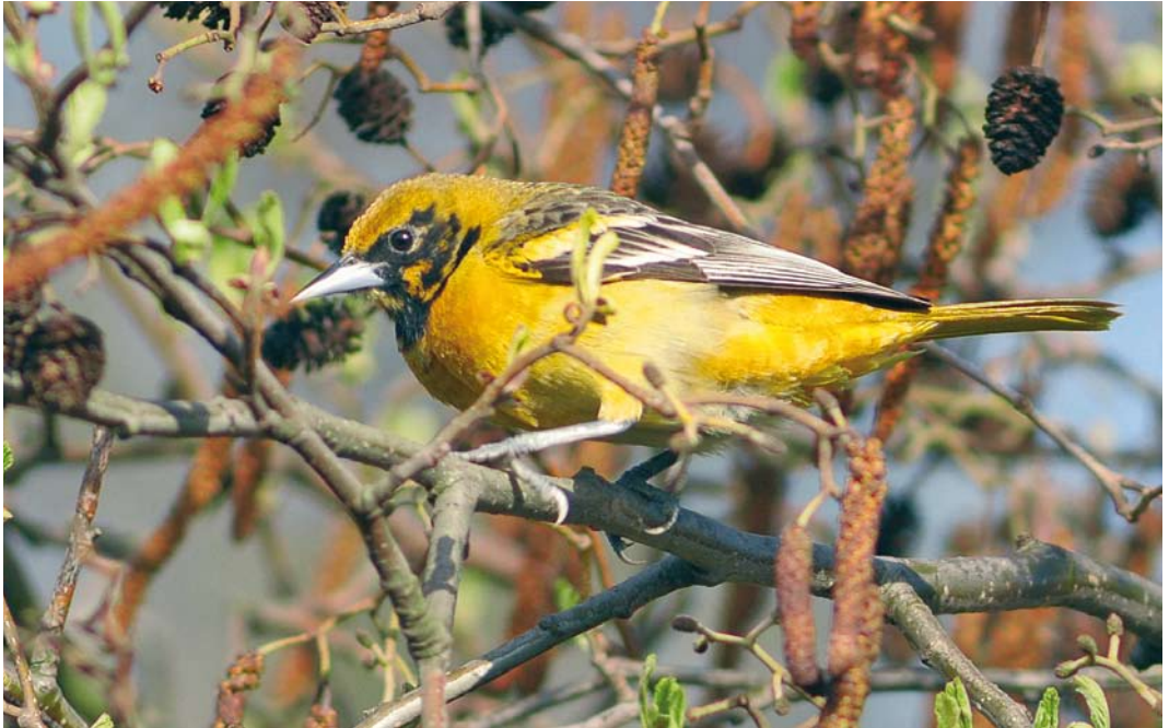
485 Baltimore Oriole / Baltimoretroepiaal Icterus galbula , first-winter male moulting to first-summer, Oudorp, Alkmaar, Noord-Holland, 11 April 2010 ( Harm Niesen )