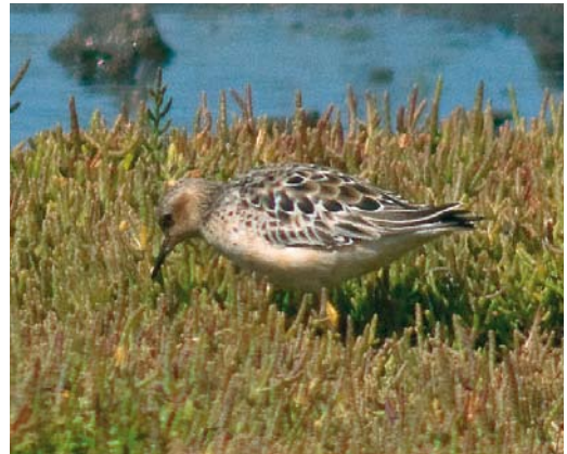
445 Lesser Yellowlegs / Kleine Geelpootruiter Tringa flavipes , Bokkegat, Wissenkerke, Zeeland, 22 July 2008 446 Lesser Yellowlegs / Kleine Geelpootruiter Tringa flavipes , Ezumakeeg, Friesland, 1 June 2008 447 White-rumped Sandpiper / Bonapartes Strandloper Calidris fuscicollis , adult, Schiermonnikoog, Friesland, 17 August 2008 448 Buff-breasted Sandpiper / Blonde Ruiter Tryngites subruficollis , adult, Ottersaat, Texel, Noord-Holland, 4 August 2008