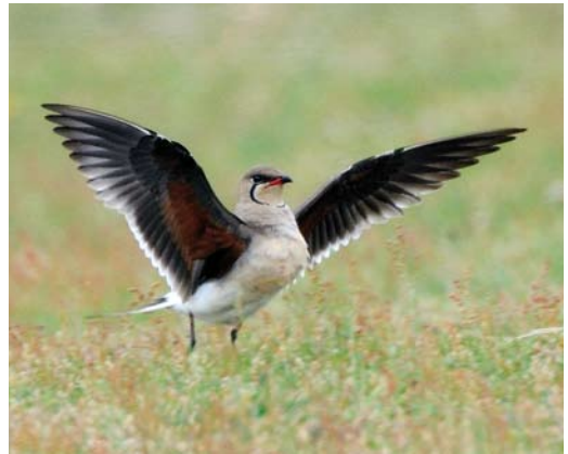
441 Pacific Golden Plover / Aziatische Goudplevier Pluvialis fulva , Ezumakeeg, Friesland, 29 June 2008 (Toy Janssen) 442 American Golden Plover / Amerikaanse Goudplevier Pluvialis dominica , Prunjepolder, Zeeland, 17 May 2008 (Marc Hoekstein) 443 Collared Pratincole / Vorkstaartplevier Clareola pratincola , Texel, Noord-Holland, 31 May 2008 (Eckard Boot) 444 Collared Pratincole / Vorkstaartplevier Clareola pratincola , Texel, Noord-Holland, 1 June 2008 (Eric Menkveld)