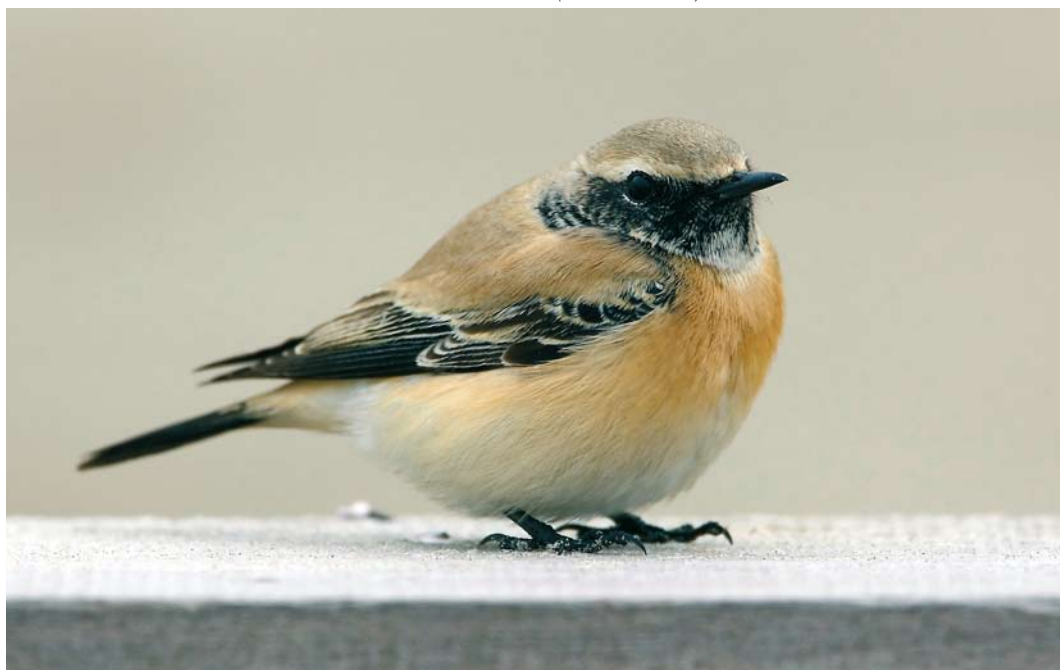
456 Desert Wheatear / Woestijntapuit Oenanthe deserti , male, Schoorl, Noord-Holland, 10 November 2008 ( Eric Menkveld )