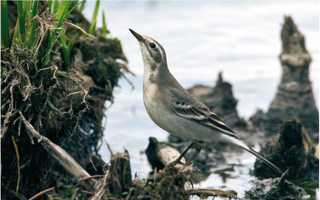
451 Citrine Wagtail / Citroenkwikstaart Motacilla citreola , first-year, Ooijpolder, Gelderland, 25 August 2008 (Harvey van Diek)