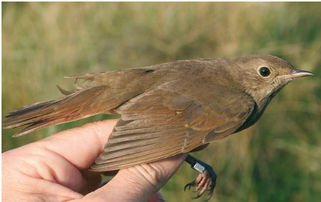
453 Thrush Nightingale / Noordse Nachtegaal Luscinia luscinia , Noordhollands Duinreservaat, Castricum, Noord-Holland, 31 August 2009