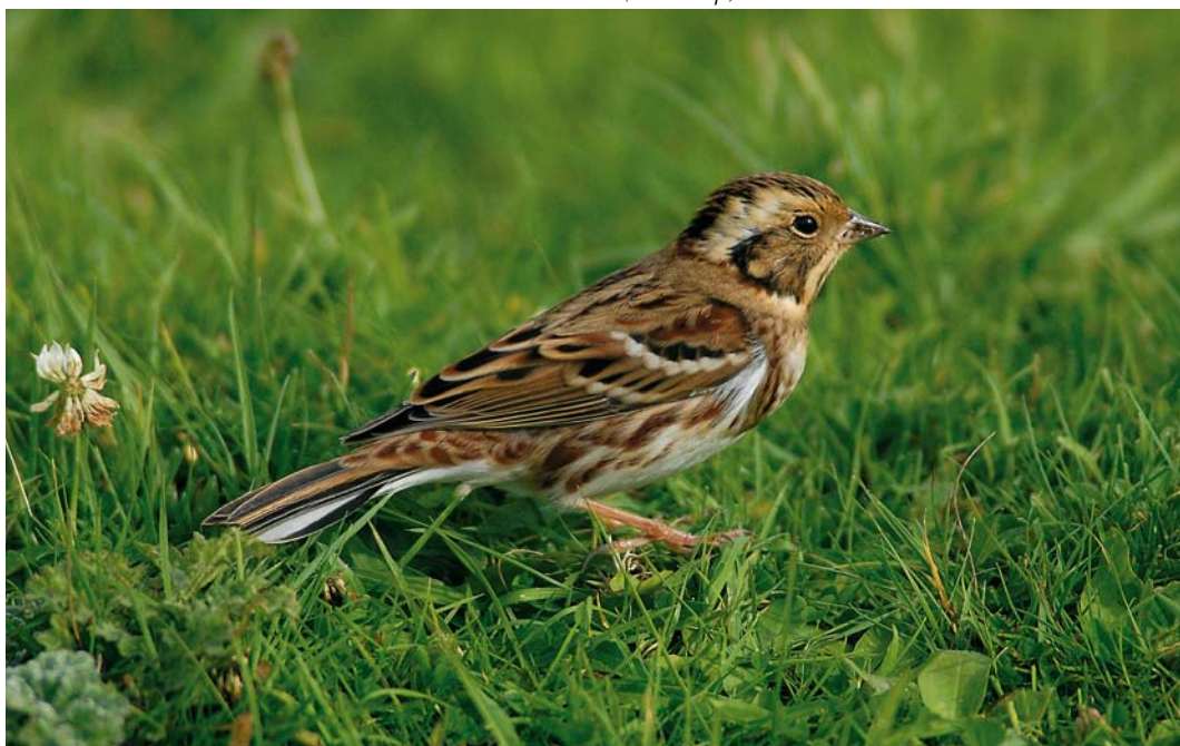
466 Rustic Bunting / Bosgors Emberiza rustica , first-year, De Cocksdorp, Texel, Noord-Holland, Netherlands, 4 October 2008 ( René Pop )