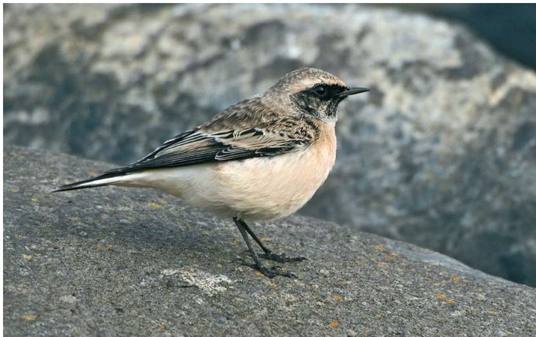
455 Pied Wheatear / Bonte Tapuit Oenanthe pleschanka , adult male, Jan Ayeslag, Texel, Noord-Holland, 13 October 2008