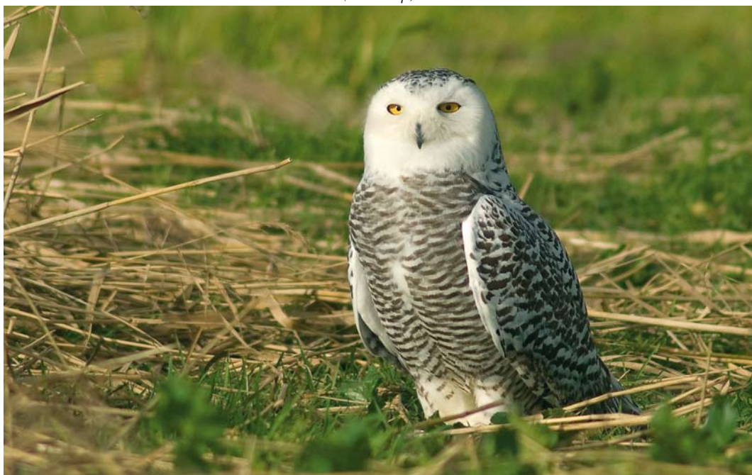
450 Snowy Owl / Sneeuwuil Bubo scandiacus , first-winter female, Texel, Noord-Holland, 17 November 2008