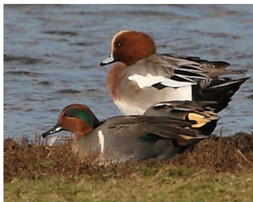
437 Spanish Imperial Eagle / Spaanse Keizerarend Aquila adalberti , second calendar-year, Loozerheide, Limburg, 6 May 2007 (René Weenink) 438 Short-toed Snake Eagle / Slangenarend Circaetus gallicus , Loozerheide, Limburg, 5 May 2008 (René Weenink) 439 Gyr Falcon / Giervalk Falco rusticolus , immature, Dollardkwelders, Groningen, 2 November 2008 (Rein Hofman) 440 Green-winged Teal / Amerikaanse Wintertaling Anas carolinensis , male, met Eurasian Wigeon / Smient A penelope , Ottersaat, Texel, Noord-Holland, 27 October 2008 (Eric Menkveld)