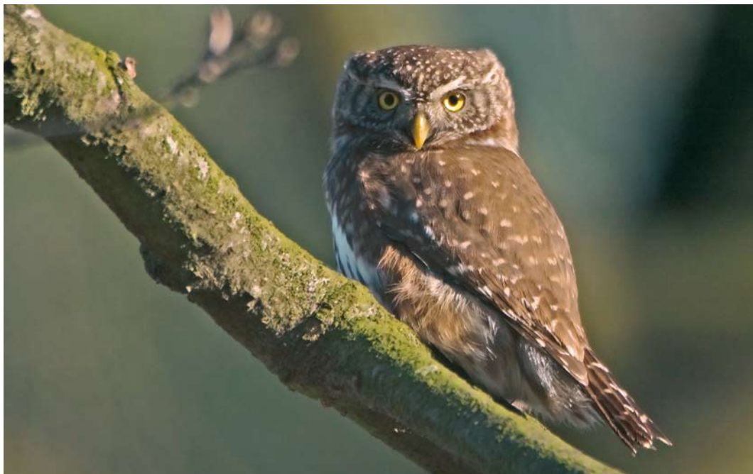
449 Eurasian Pygmy Owl / Dwerguil Glaucidium passerinum , Leenderbos, Noord-Brabant, 11 February 2008 (Jan-Kees Schwiebbe)