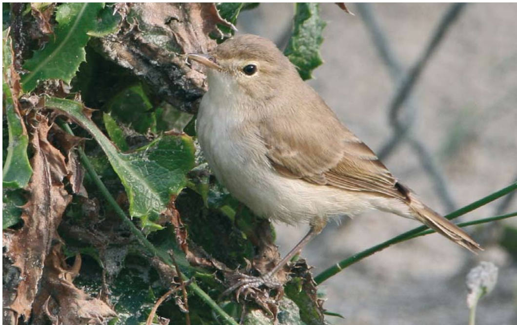
465 Booted Warbler / Kleine Spotvogel Acrocephalus caligatus , Maasvlakte, Zuid-Holland, Netherlands, 13 September 2008 ( Martin van der Schalk )