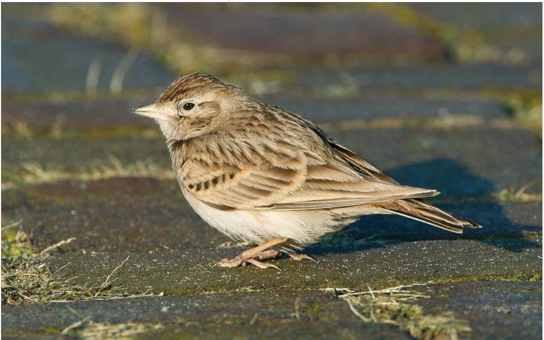
452 Greater Short-toed Lark / Kortteenleeuwerik Calandrella brachydactyla , Castricum aan Zee, Noord-Holland, 6 January 2008 (René van Rossum)