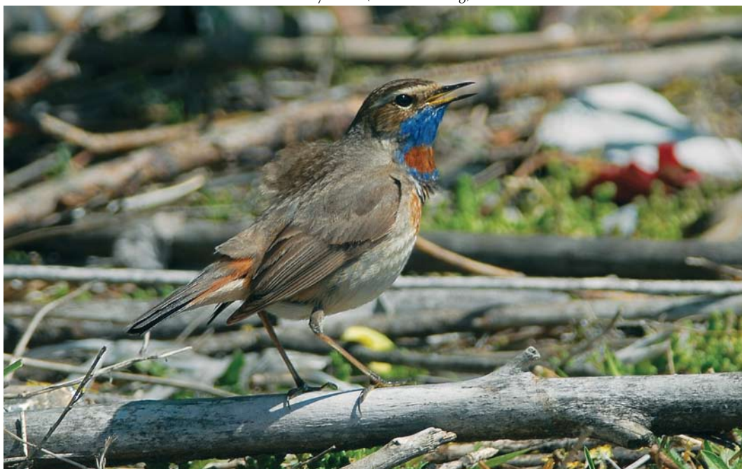
454 Red-spotted Bluethroat / Roodsterblauwborst Luscinia svecica svecica , male, Maasvlakte, Zuid-Holland, 18 May 2008