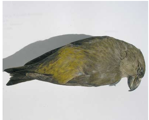
461 Rufous-tailed Rock Thrush / Rode Rotslijster Monticola saxatilis , male, Drouwenerzand, Drenthe, 10 May 2008 462 Rustic Bunting / Bosgors Emberiza rustica , first-year female, Groene Glop, Schiermonnikoog, Friesland, 17 November 2008 463 Parrot Crossbill / Grote Kruisbek Loxia pytyopsittacus , Schoorl, Noord-Holland, Netherlands, 4 January 2008 464 Parrot Crossbill / Grote Kruisbek Loxia pytyopsittacus , female (found dead at Eerbeek, Gelderland, on 7 March 2008), Eerbeek, Gelderland, 24 March 2008

This concerns a date extension of a record already mentioned in van der Vliet et al (2002). It appears that the bird was trapped not only on 13 September but also two days earlier (André van Loon/Vrs Schiermonnikoog in litt).