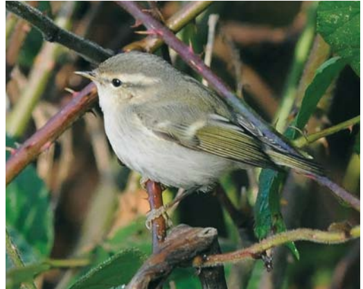
457 Red-flanked Bluetail / Blauwstaart Tarsiger cyanurus , Kroonspolders, Vlieland, Friesland, 6 October 2008 458 Red-flanked Bluetail / Blauwstaart Tarsiger cyanurus , Groene Glop, Schiermonnikoog, Friesland, 29 October 2008 459 Paddyfield Warbler / Veldrietzanger Acrocephalus agricola , Zwanenwater, Noord-Holland, 4 June 2008 460 Hume's Leaf Warbler / Humes Bladkoning Phylloscopus humei , Offingawier, Friesland, 6 December 2008

photographed, videoed (T Fijen, T van Kessel, C Brinkman et al; Dutch Birding 30: 443, plate 531, 2008)