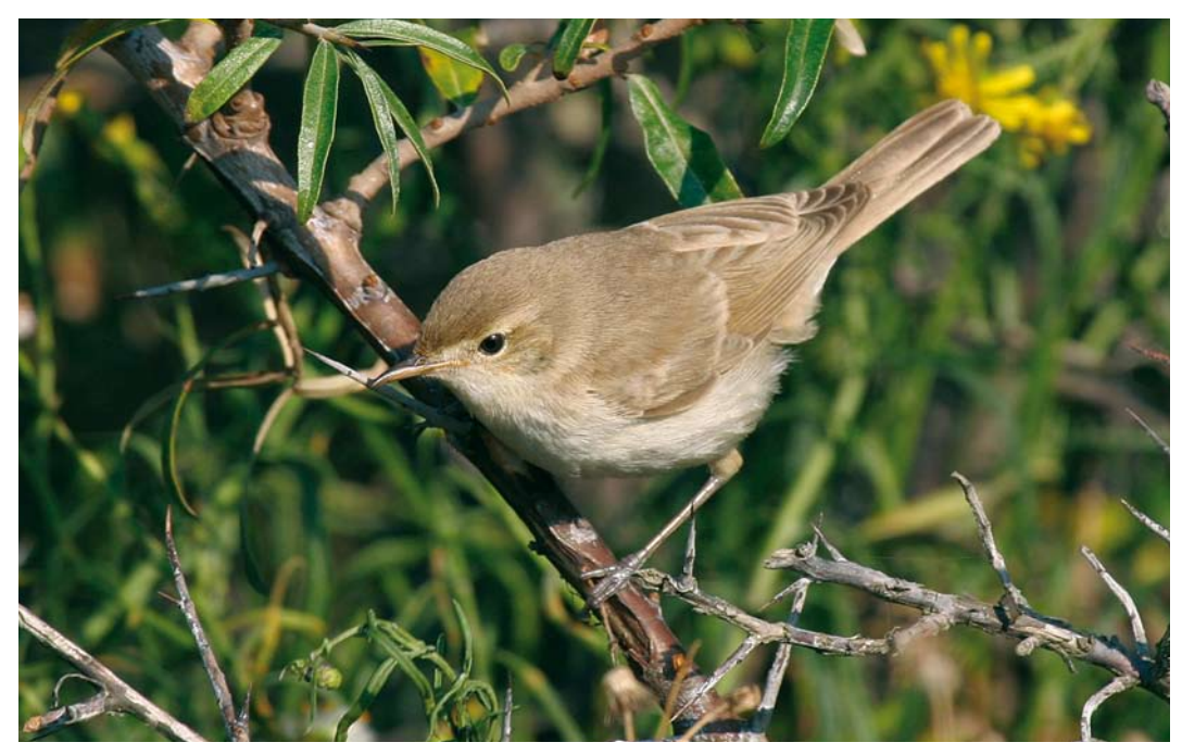
460 Booted Warbler / Kleine Spotvogel Acrocephalus caligatus, Maasvlakte, Zuid-Holland, 16 September 2007