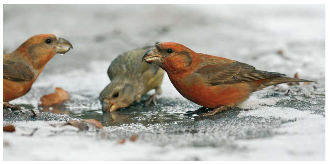
461 Eastern Crowned Warbler / Kroonboszanger Phylloscopus coronatus, Katwijk aan Zee, Zuid-Holland, 5 October 2007 462 Mongoolse Pieper / Blyth's Pipit Anthus godlewskii, Woerden, Utrecht, 24 January 2007 463 Parrot Crossbills / Grote Kruisbekken Loxia pytyopsittacus, Schoorl, Noord-Holland, 4 January 2008

photographed, sound-recorded (S Bot, M Gal, S Wytema et al); 9 October, Eemshaven, Eemsmond, Groningen, ringed, photographed (L Tervelde); 8-12 December, Amsterdamse Bos, Amsterdam, Noord-Holland, photographed, sound-recorded (R Heemskerk).