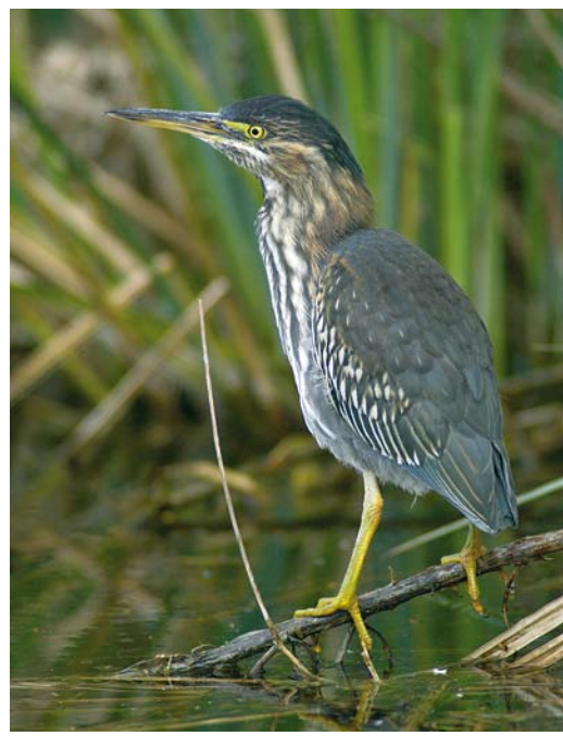
449 Green Heron / Groene Reiger Butorides virescens, third-year, Noorder IJplas, Amsterdam, Noord-Holland, 1 June 2007 450 Green Heron / Groene Reiger Butorides virescens, second calendar-year, Nieuwe Meer, Amsterdam, Noord-Holland, 28 April 2006 451 Squacco Heron / Ralreiger Ardeola ralloides, Julianadorp, Noord-Holland, 2 August 2007