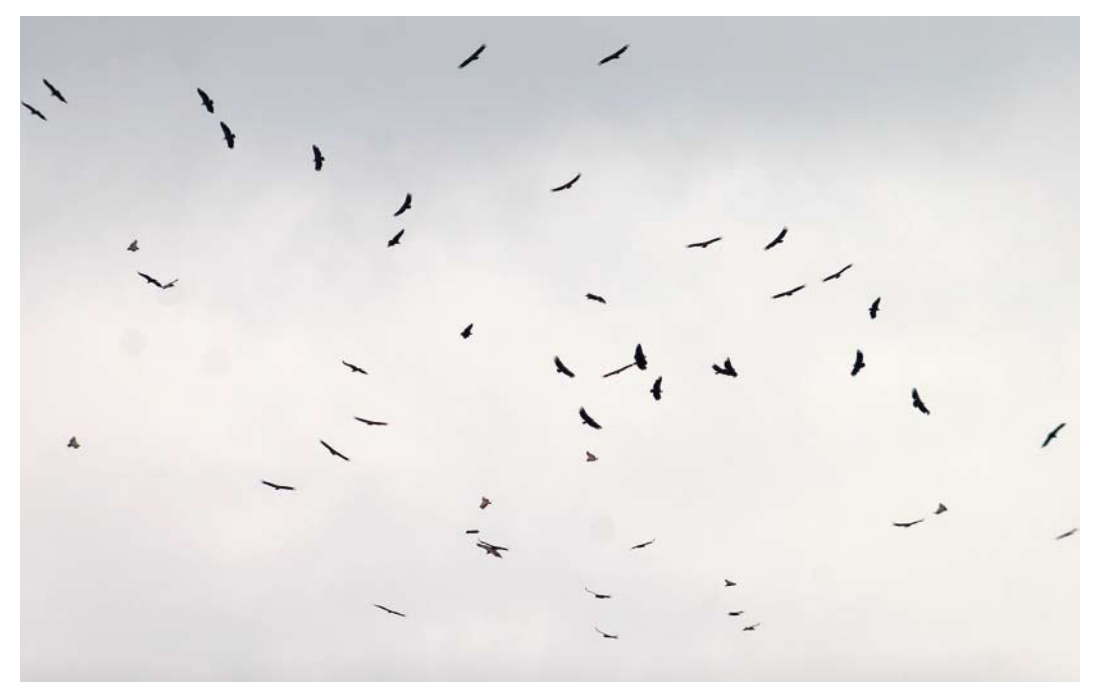
452 Griffon Vultures / Vale Gieren Gyps fulvus, Oostburg, Zeeland, 18 June 2007 (Pim A Wolf)

ber 2006, when it was taken into care; also, it is regarded as the same individual seen in Germany on 2-15 July (it was not seen in the Netherlands between from 1 June to 19 July) (Hudson & Rarities Committee 2008). It has been accepted by BBRC in Category D of the British list.