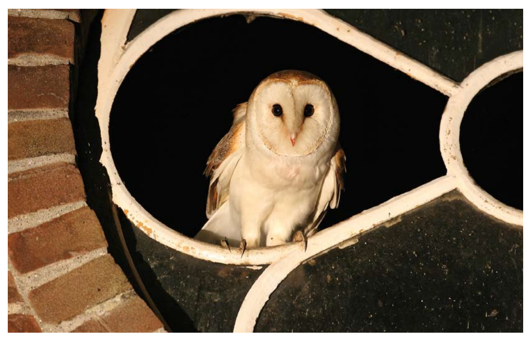
457 Pale Barn Owl / Witte Kerkuil Tyto alba alba , Zuid-Holland, 11 July 2007

partly because of uncertainties about its status. For instance, de long (1995) suggests that 'intermediates' between this taxon and Dark Barn Owl T a guttata occur regularly in the southern Netherlands. The only Pale Barn Owl mentioned by van den Berg & Bosman (2001) concerns a photographed bird ringed south-west of Ommen, Overijssel, on 22 January 1976 and found dead as road victim at Varades, Loire-Atlantique, France, on 22 April 1976 (Limosa 54: 97-98, 1981). This record has not been formally considered by the CDNA and will be reviewed. As a consequence, it seems possible that the 1983 specimen will turn out to be the first record of this subspecies; it was found while studying the differences with Dark Barn Owl and was wrongly labelled as the latter. Information about the location of the individual photographed in 2007 is withheld at the request of the observers.