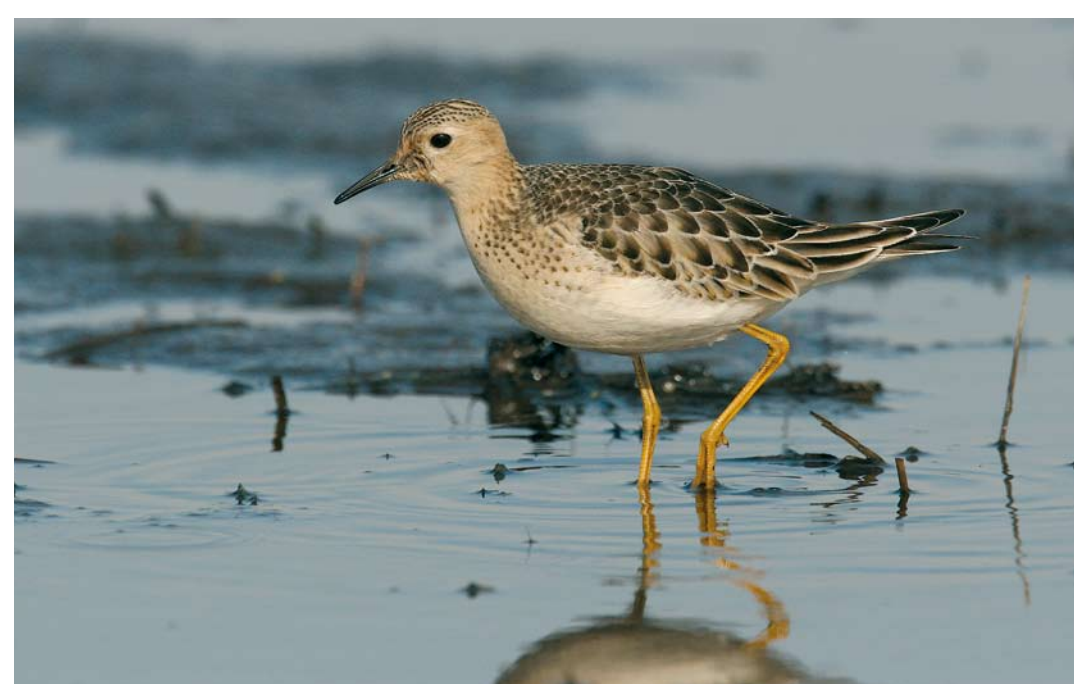
Buff-breasted Sandpiper / Blonde Ruiter Tryngites subruficollis, first-year, Petten, Noord-Holland, 11 October 2007

Baltic Gull / Baltische Mantelmeeuw Larus fuscus fuscus , first-year, Vinkhuizen, Groningen, Groningen, 19 December 2006