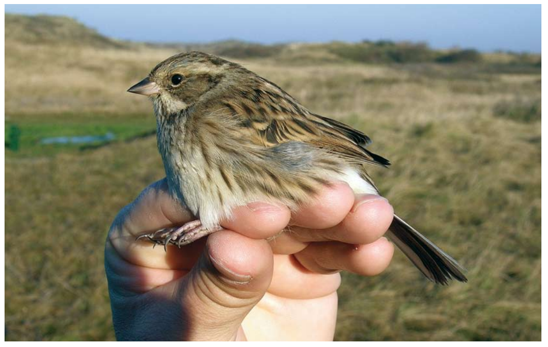
465 Black-faced Bunting / Maskergors Emberiza spodocephala, first-year female, Noordhollands Duinreservaat, Castricum, Noord-Holland, 18 November 2007

2008, Hargen aan Zee and Schoorl, Bergen , Noord-Holland, minimum of nine (five males and four female-types), photographed, sound-recorded, videoed (J Stok, C Oosterhuis et al; Ebels 2008; Dutch Birding 30: 55, plate 76, 61, plate 80, 62, plate 81-82, 2008).