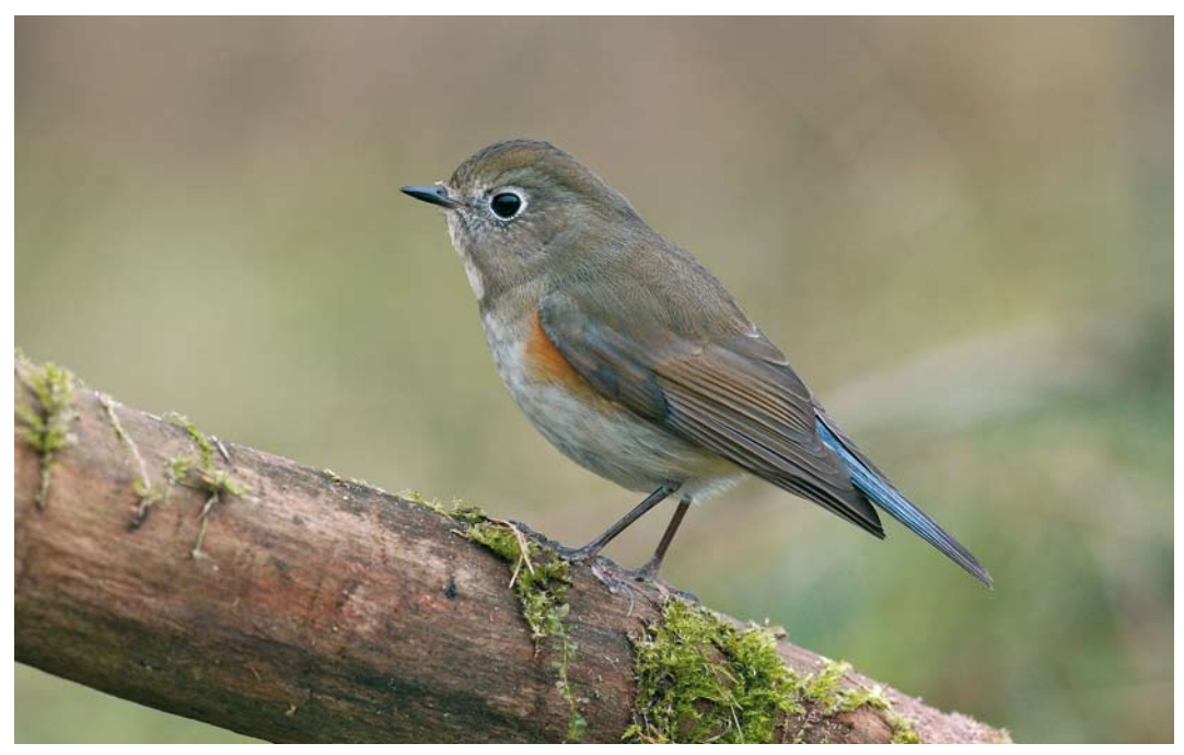
Red-flanked Bluetail / Blauwstaart Tarsiger cyanurus , first-year male, Zandvoort, Noord-Holland, 2 February 2007

Pied Wheatear / Bonte Tapuit Oenanthe pleschanka , male, De Cocksdorp, Texel, Noord-Holland, 3 October 2007