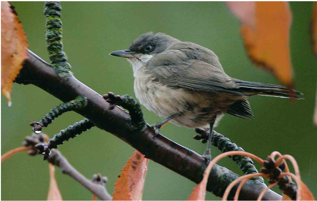
500 Western Orphean Warbler / Westelijke Orpheusgrasmus Sylvia hortensis , Middelburg, Zeeland, 31 October 2003 ( Bas van den Boogaard ) 501 Desert Wheatear / Woestijntapuit Oenanthe deserti , first-summer male, Fochteloërveen, Drenthe, 6 April 2005 ( Roland Jansen ) 502 Two-barred Crossbill / Witbandkruisbek Loxia leucoptera bifasciata , male, Wateren, Drenthe, 9 February 2005 ( Roland Jansen )