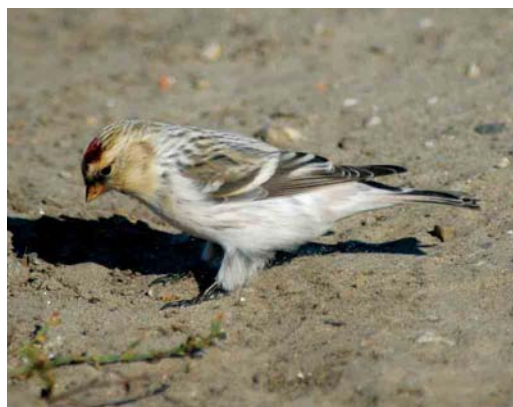
503 Lesser Grey Shrike / Kleine Klapekster Lanius minor , adult female, Groote Vlak, Texel, Noord-Holland, 5 October 504 Desert Wheatear / Woestijntapuit Oenanthe deserti , first-year male, Westerstrand, Schiermonnikoog, Friesland, 29 October 2005 505-506 Desert Wheatear / Woestijntapuit Oenanthe deserti , first-year male, IJmuiden, Noord-Holland, 13 November 2005 507 Arctic Redpoll / Witstuitbarmsijs Carduelis hornemanni exilipes , first-winter, Oosterscheldekering, Westenschouwen, Zeeland, 19 November 2005 508 Hornemann's Redpoll / Groenlandse Witstuitbarmsijs Carduelis hornemanni hornemanni , adult male, Huisduinen, Noord-Holland, 15 October 2003