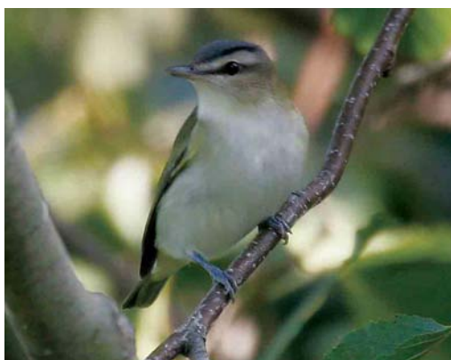
509 Greenish Warbler / Grauwe Fitis Phylloscopus trochiloides , Bodegraven, Zuid-Holland, 10 June 2005 510 Iberian Chiffchaff / Iberische Tjiftjaf Phylloscopus ibericus , Bergen, Noord-Holland, 25 May 2005 511 Siberian Chiffchaff / Siberische Tjiftjaf Phylloscopus collybita tristis , Westkapelle, Zeeland, 11 October 2005 512 Red-eyed Vireo / Roodoogvireo Vireo olivaceus , Westkapelle, Zeeland, 9 October 2005

Zuid-Holland, on 31 May 2003 (van Rijswijk 2004); it was part of an unprecedented influx to north-western and northern Europe (cf Olthoff 2006).