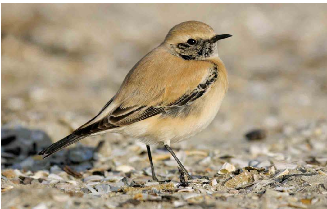
499 Desert Wheatear / Woestijntapuit Oenanthe deserti , first-year male, IJmuiden, Noord-Holland, 22 November 2005