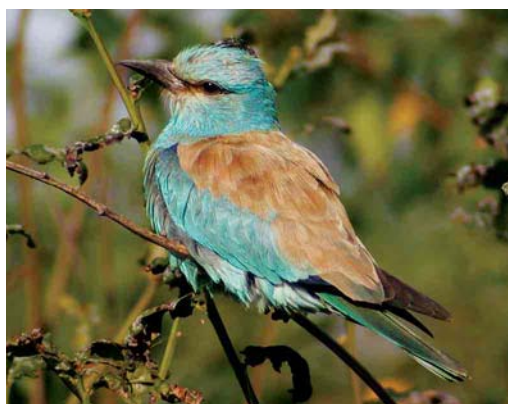
484 Squacco Heron / Ralreiger Ardeola ralloides , adult, Alblasterdam, Zuid-Holland, 2 July 2005 485 Great Snipe / Poelsnip Gallinago media , Hessenpoort, Zwolle, Overijssel, 13 September 2005 486 Eurasian Pygmy Owl / Dwerguil Glaucidium passerinum , Sumarreheide, Friesland, 4 October 2002 487 European Roller / Scharrelaar Coracias garrulus , adult, Texel, Noord-Holland, 16 September 2005