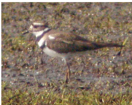
488 Buff-breasted Sandpiper / Blonde Ruitter Tryngites subruficollis , juvenile, Harpel, Groningen, 2 October 1982 (Nico de Vries) 489 Red-necked Stint / Roodkeelstrandloper Calidris ruficollis , adult, Wagejot, Texel, Noord-Holland, 24 July 2005 (René Pop) 490 Terek Sandpiper / Terekrutter Xenus cinereus , Wagejot, Texel, Noord-Holland, 15 May 2005 (René Pop) 491 Terek Sandpiper / Terekrutter Xenus cinereus , De Braakman, Zeeland, 7 June 2005 (Mark S J Hoekstein) 492 Killdeer / Killdeerplevier Charadrius vociferus , second calendar-year, Rottige Meente, Overijssel, 4 April 2005 (Roland Jansen) 493 Killdeer / Killdeerplevier Charadrius vociferus , second calendar-year, Rottige Meente, Overijssel, 4 April 2005 (Leo J R Boon/Cursorius)