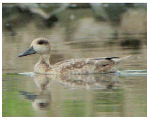
479 Ring-necked Duck / Ringsnaveleend Aythya collaris , first-year female, Budel-Dorplein, Noord-Brabant, 23 October 2005 480 Eastern Imperial Eagle / Keizerarend Aquila heliaca , third calendar-year, Kamperhoek, Flevoland, 3 April 2005 481 Falcated Duck / Bronskopeend Anas falcata , adult male, with Eurasian Wigeon / Smient A penelope , male, Nijkerkernauw, Gelderland, 30 March 2005 482 Marbled Duck / Marmereend Marmaronetta angustirostris , juvenile, Doornenburg, Gelderland, 15 August 2004