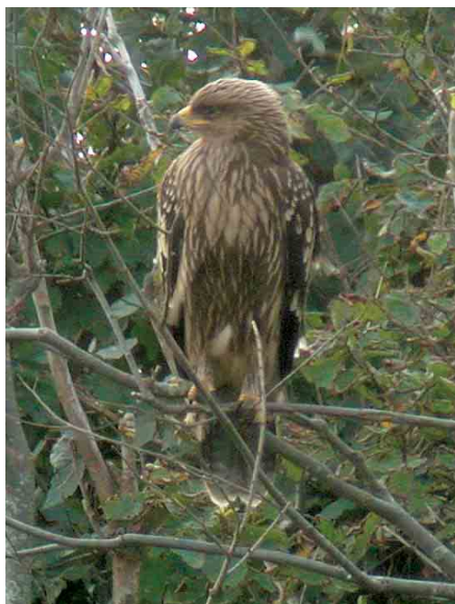
483 Lesser Spotted Eagle / Schreeuwarend Aquila pomarina , juvenile, Domburg, Zeeland, 24 September 2005

24-25 September, Domburg, Westkapelle, Oostkapelle and Grijskerke, Veere , Zeeland, juvenile, photograph-