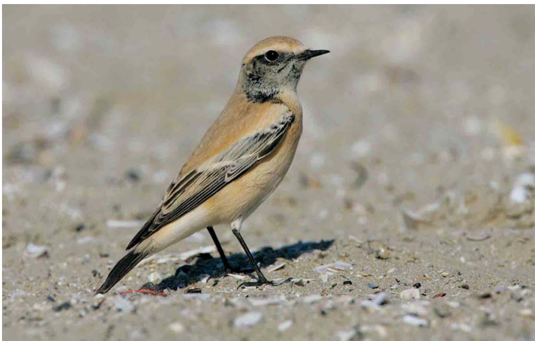
498 Desert Wheatear / Woestijntapuit Oenanthe deserti , first-year male, IJmuiden, Noord-Holland, 24 September 2005 ( René van Rossum )