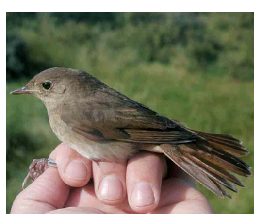
469 Melodious Warbler / Orpheusspotvogel Hippolais polyglotta, Ter Apel, Groningen, 20 May 2004 470 River Warbler / Krekelzanger Locustella fluviatilis, 't Twiske, Noord-Holland, 2 June 2004 471 Hume's Leaf Warbler / Humes Bladkoning Phylloscopus humei, Reusel, Noord-Brabant, 14 November 2004 472 Thrush Nightingale / Noordse Nachtegaal Luscinia luscinia, Bloemendaal, Noord-Holland, 9 September 2004