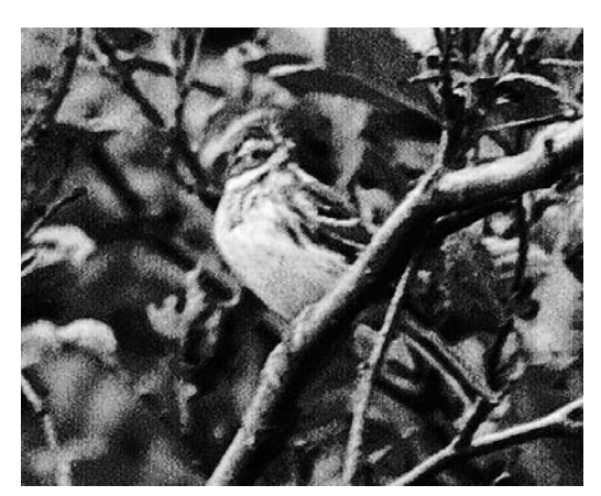
476 Rustic Bunting / Bosgors Emberiza rustica , Lies, Terschelling, Friesland, 29 September 1972

at Natuurmuseum Fryslân, Leeuwarden), photographed (A Hoekstra; van Dijl & Bosma 2004, Bosma et al 2005; Dutch Birding 27: 316, plate 386-387, 2005); 16-20 November, Beijum, Groningen, Groningen, two, adult male and probably adult female, photographed, sound-recorded, videoed (J G Bosma, R Cazemier, E B Ebels et al; van Dijl & Bosma 2004, Bosma et al 2005, Schoonhoven 2005; Birding World 17: 461, 2004, Dutch Birding 26: 434, plate 612-613, 2004, 27: 74, plate 84, 86, 75, plate 87, 315, plate 385, 318, plate 390-391, 319, plate 392-393, 320, plate 394-395, 321, figure 1-2, 323, plate 396-398, 324, plate 399-401, 326, plate 402, 2005); 16-20 November, Huiswaard, Alkmaar, Noord-Holland, at least one, female-type, photographed (C Seijbel, J Hoedjes; Bosma et al 2005; Dutch Birding 27: 316, plate 388-389,