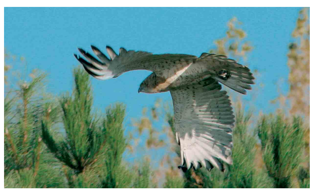
451 Short-toed Eagle / Slangenarend Circaetus gallicus, juvenile, IJmeerdijk, Flevoland, 27 October 2004