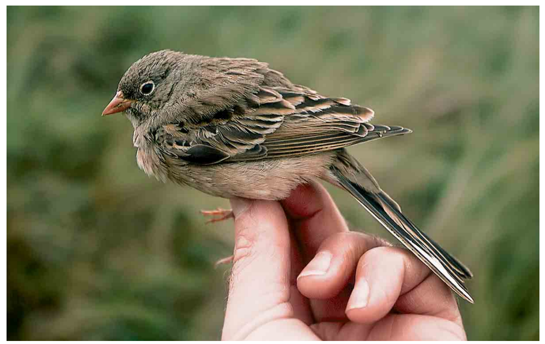
Grey-necked Bunting / Steenortolaan Emberiza buchanani , first-winter, Castricum, Noord-Holland, 16 October 2005

Atlas Chaffinch / Atlasvink Fringilla coelebs africana, first-summer male, Maasvlakte, Zuid-Holland, 5 April 2003