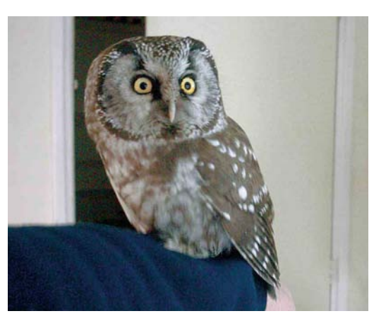
468 Tengmalm's Owl / Ruigpootuil Aegolius funereus , Hoogeveen, Drenthe, 2 April 2004