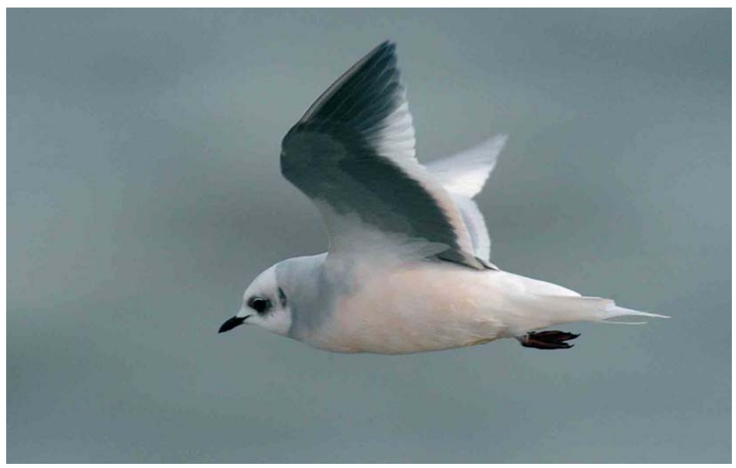
Ross's Gull / Ross' Meeuw Rhodostethia rosea, adult, Scheveningen, Zuid-Holland, 21 November 2004 ( Marten van Dijl )

Ring-billed Gull / Ringsnavelmeeuw Larus delawarensis , adult, Tiel, Gelderland, 30 January 2004 ( Marten van Dijl )