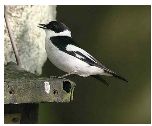
473 Collared Flycatcher / Withalsvliegenvanger Ficedula albicollis, male, Noord-Ginkel, Gelderland, May 2004

1-14 January, Grou, Boarnsterhim , Friesland, photographed, sound-recorded, videoed (G Mensink, M Schulte, M Berlijn et al; Dutch Birding 26: 143, plate 209, 2004); 11-14 November, Reusel, Reusel-De Mierden , Noord-Brabant, ringed, photographed (J Wouters, P Wouters). 2003 11-12 October, De Cocksdorp, Texel , Noord-Holland, photographed (D Kok, J de Bruijn, L B Steijn