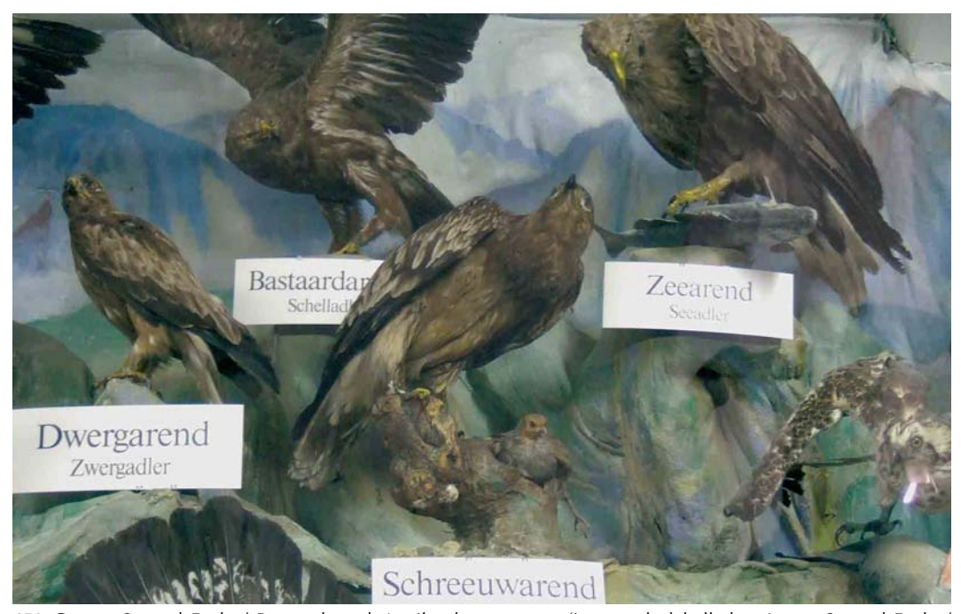
452 Greater Spotted Eagle / Bastaardarend Aquila clanga, centre (incorrectly labelled as Lesser Spotted Eagle / Schreeuwarend A pomarina; collected at Boshoven, Limburg, on 5 November 1892), Missiemuseum, Steyl, Limburg, 8 September 2005 (Justin J F J Jansen) 453 Cream-coloured Courser / Renvogel Cursorius cursor, male (collected at Faan, Niekerk, Groningen, on 20 November 1909), Zwartsluis, Overijssel, 23 October 2005 (Bert de Bruin) 454 Stone-curlew / Griel Burhinus oedicnemus (found dead at Ohé en Laak, Limburg, on 2 May 1975), Broekhuizervorst, Limburg, 10 November 2005 (Justin J F J Jansen)