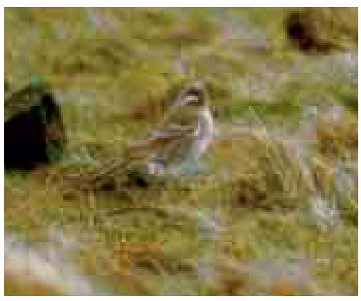
477 Pine Bunting / Witkopgors Emberiza leuco-cephalos , male, Kooioerdstuifdijk, Ameland, Friesland, 15 March 1998 ( Rommert Cazemier )

The first record. The bird stayed for a short period,