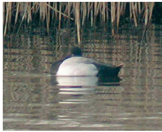
448 Lesser Scaup / Kleine Topper Aythya affinis, male, Goes, Zeeland, 17 March 2004

2003 4-5 January, Kraaijenbergse Plassen, Cuijk , Noord-Brabant, adult male, photographed (E van Winden, R Winters, P Palmen et al); 7 January to 16 February, Surch (Zurich) and Koarnwertersân (Kornwerderzand), Wûnseradiel , Friesland, male, photographed (R Cazemier, S Bernardus, J Bisschop).