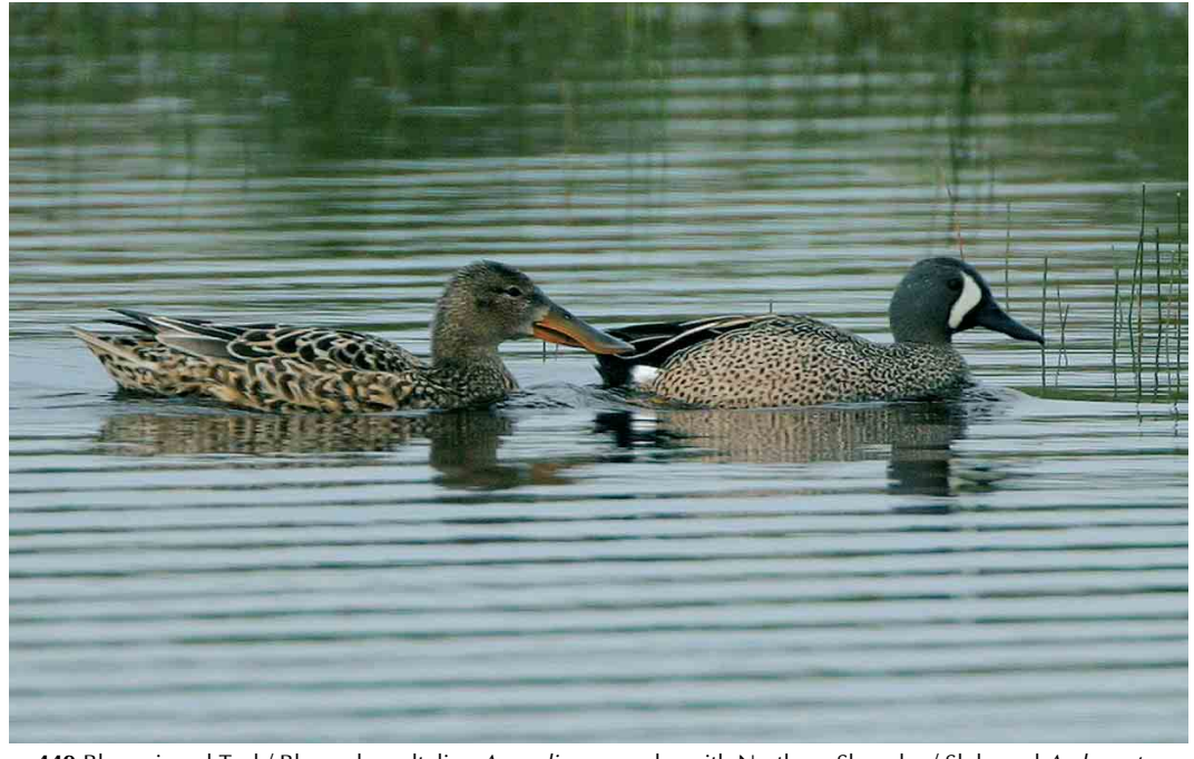
Blue-winged Teal / Blauwvleugeltaling Anas discors , male, with Northern Shoveler / Slobeend A clypeata , female, Groote Vlak, Texel, Noord-Holland, 20 May 2004 ( Bas van den Boogaard )