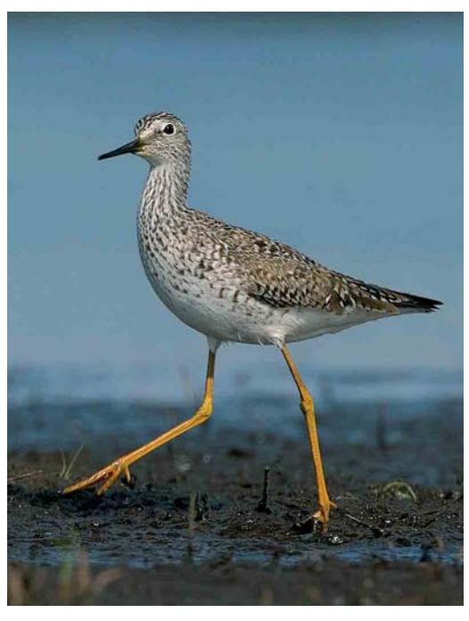
Long-billed Dowitcher / Grote Grijze Snip Limnodromus scolopaceus , first-year, Veerse Meer, Zeeland, 24 april 2004 ( Bas van den Boogaard ) 456 Lesser Yellowlegs / Kleine Geelpootruiter Tringa flavipes , Annermoeras, Spijkerboor, Drenthe, 21 May 2004 ( Bas van den Boogaard ) 457 Red-necked Stint / Roodkeelstrandloper Calidris ruficollis , adult, Slikken van Flakkee, Zuid-Holland, 6 July 2004 ( Pim A Wolf )