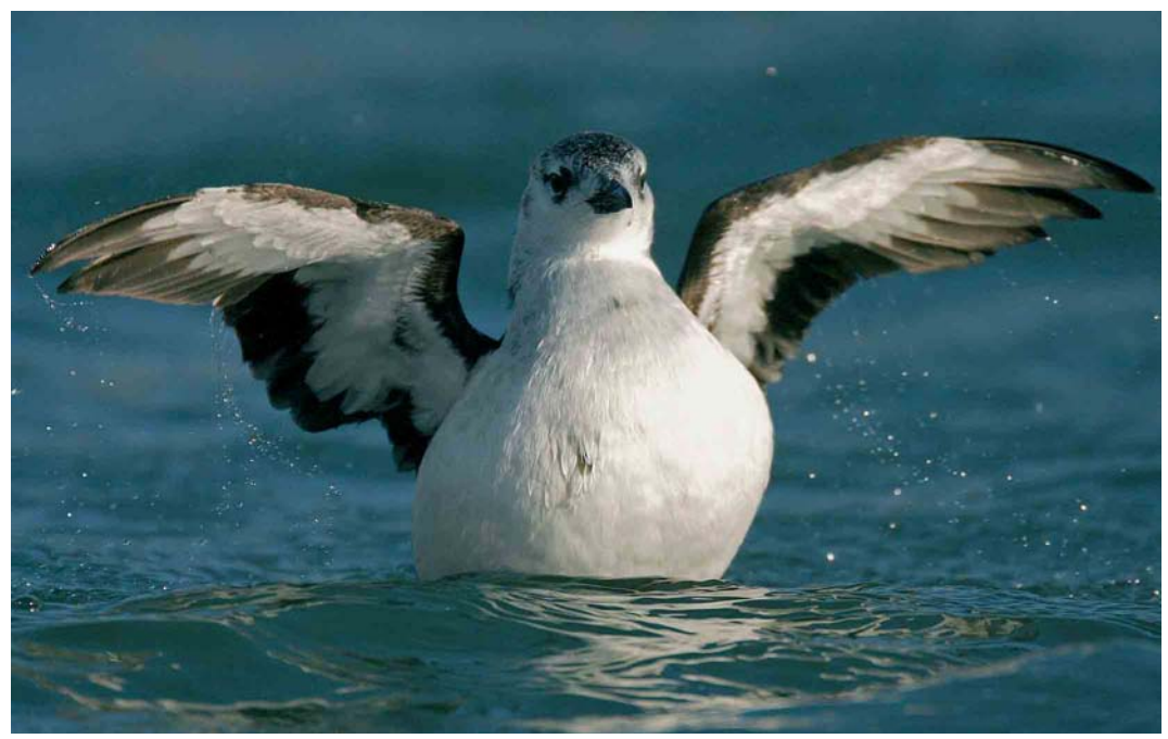
466 Black Guillemot / Zwarte Zeekoet Cepphus grylle , adult, West-Terschelling, Terschelling, Friesland, 16 January 2005 ( Harvey van Diek )

467 Roseate Tern / Dougalls Stern Sterna dougallii , adult, Roggenplaat, Zeeland, 13 August 2004 ( Pim A Wolf )