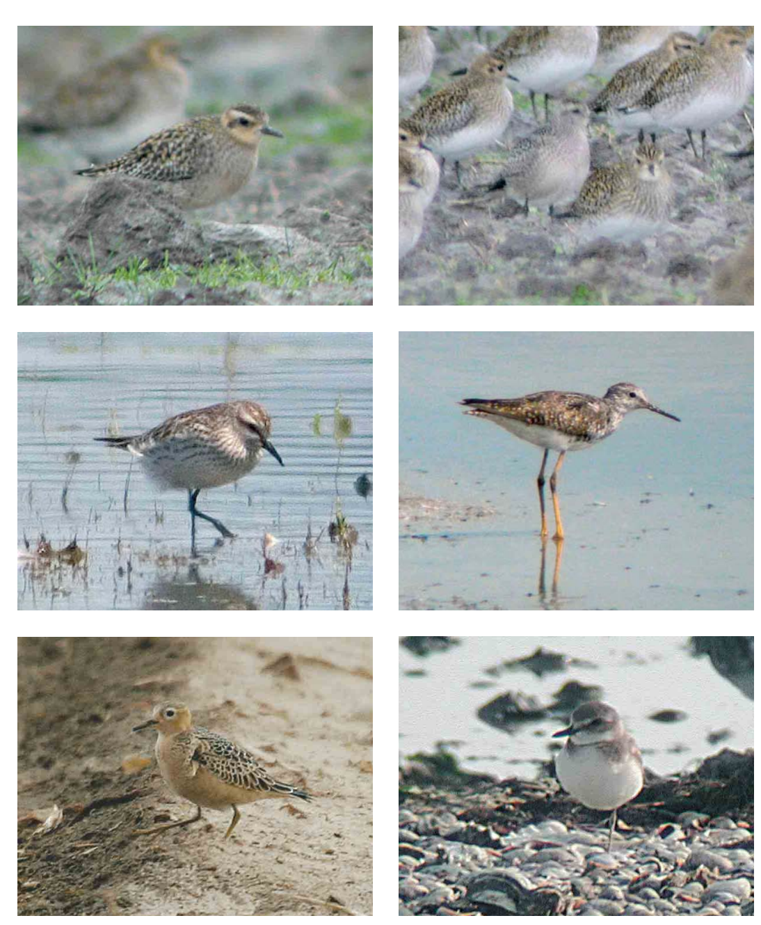
458 Pacific Golden Plover / Aziatische Goudplevier Pluvialis fulva , Grijpskerke, Zeeland, 14 January 2004 ( Leo J R Boon/Cursorius ) 459 American Golden Plover / Amerikaanse Goudplevier Pluvialis dominica (centre), Grijpskerke, Zeeland, 14 January 2004 ( Leo J R Boon/Cursorius ) 460 White-rumped Sandpiper / Bonapartes Strandloper Caldidris fuscicollis , De Hamert, Limburg, 22 May 2004 ( Patrick Palmen ) 461 Lesser Yellowlegs / Kleine Geelpootruiter Tringa flavipes , Eemshaven, Groningen, 10 August 2004 ( Martijn Bot ) 462 Buff-breasted Sandpiper / Blonde Ruiter Tryngites subruficollis , juvenile, De Hemmer, Texel, Noord-Holland, 28 September 2004 ( Ronald A van Dijk ) 463 Greater Sand Plover / Woestijnplevier Charadrius leschenaultii , adult, Battenoord, Zuid-Holland, 16 September 2004 ( Pim A Wolf )