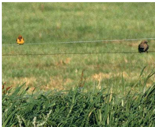
272 Red-headed Bunting / Bruinkopgors Emberiza bruniceps , male, Haersterbroek, Zwolle, Overijssel, August 1981 (Nanne Nauta)

Alarmed birders searching for the 1983 bird in pouring rain in 10 hectares of five-feet high, densely grown fields first used the now widely known term 'Don Quixoting'. A report on 8 October 1999 on Terschelling, Friesland, has not (yet) been submitted (cf van Dongen et al 1999) and a report from 23 May 1987 at De Cocksdorp, Texel, Noord-Holland, is still in circulation.