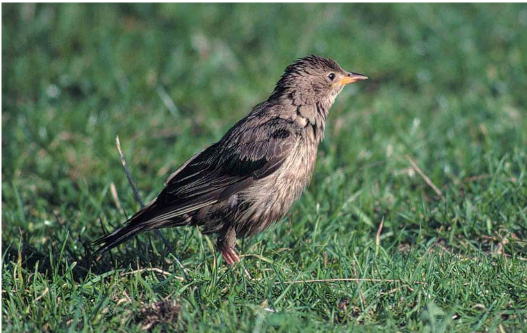
271 Rose-coloured Starling / Roze Spreeuw Sturnus roseus , juvenile moulting to first-winter, Camperduin, Noord-Holland, 12 November 1999