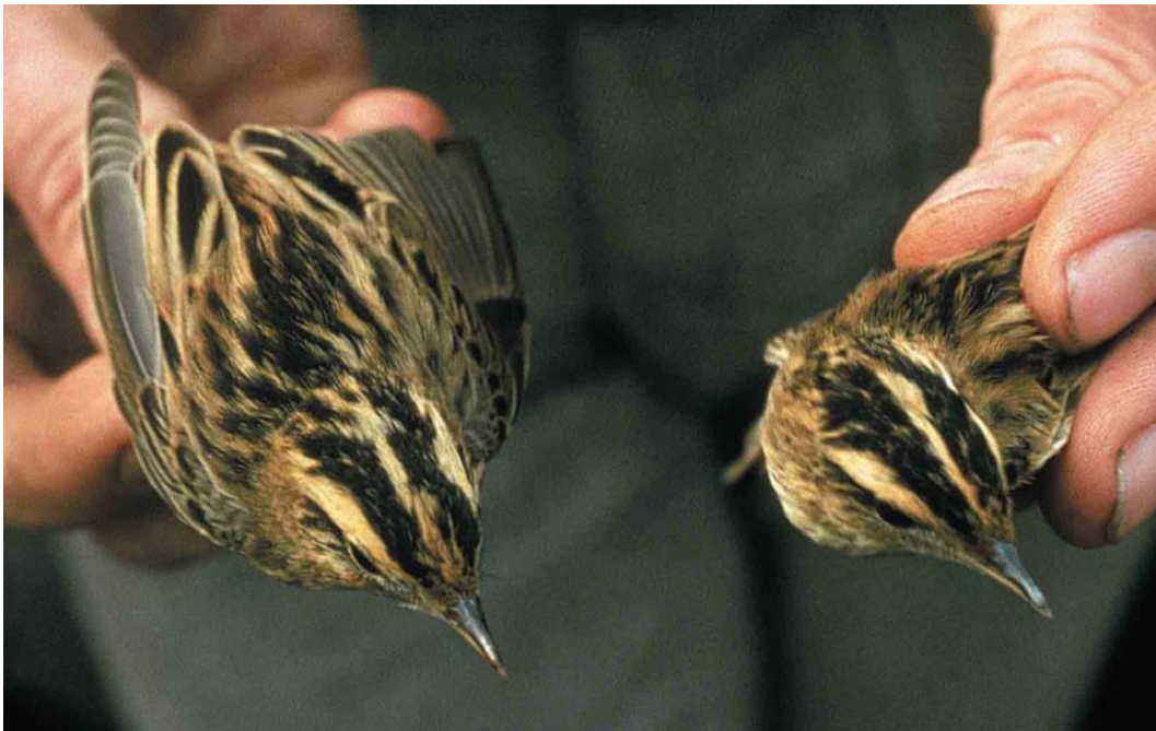
270 Aquatic Warblers / Waterrietzangers Acrocephalus paludicola , first-winter, Verdrongen Land van Saeftinge, Zeeland, 24 August 1977 (G J Slob)