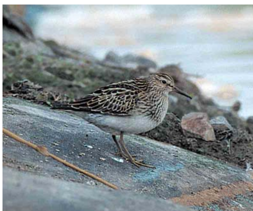
255 Golden Eagle / Steenarend Aquila chrysaetos , first-winter, Terschelling, Friesland, 19 October 1999 (Arie Ouwerkerk) 256 Forster's Tern / Forsters Stern Sterna forsteri , adult winter, De Boschplaat, Terschelling, Friesland, 14 November 1999 (Arie Ouwerkerk) 257 Lesser Yellowlegs / Kleine Geelpootruiter Tringa flavipes , adult, Jaap Deensgat, Lauwersmeer, Groningen, August 1999 (Eric Koops) 258 Pectoral Sandpiper / Gestreepte Strandloper Calidris melanotos , juvenile, Hoogkerk, Groningen, 18 September 1999 (Lucien Davids)