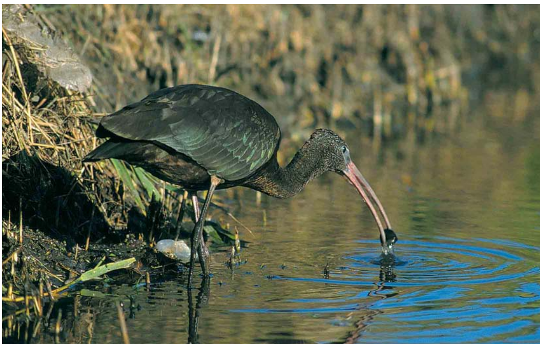
254 Glossy Ibis / Zwarte Ibis Plegadis falcinellus , Burgervlotbrug, Noord-Holland, 12 November 1999 (René Pop)