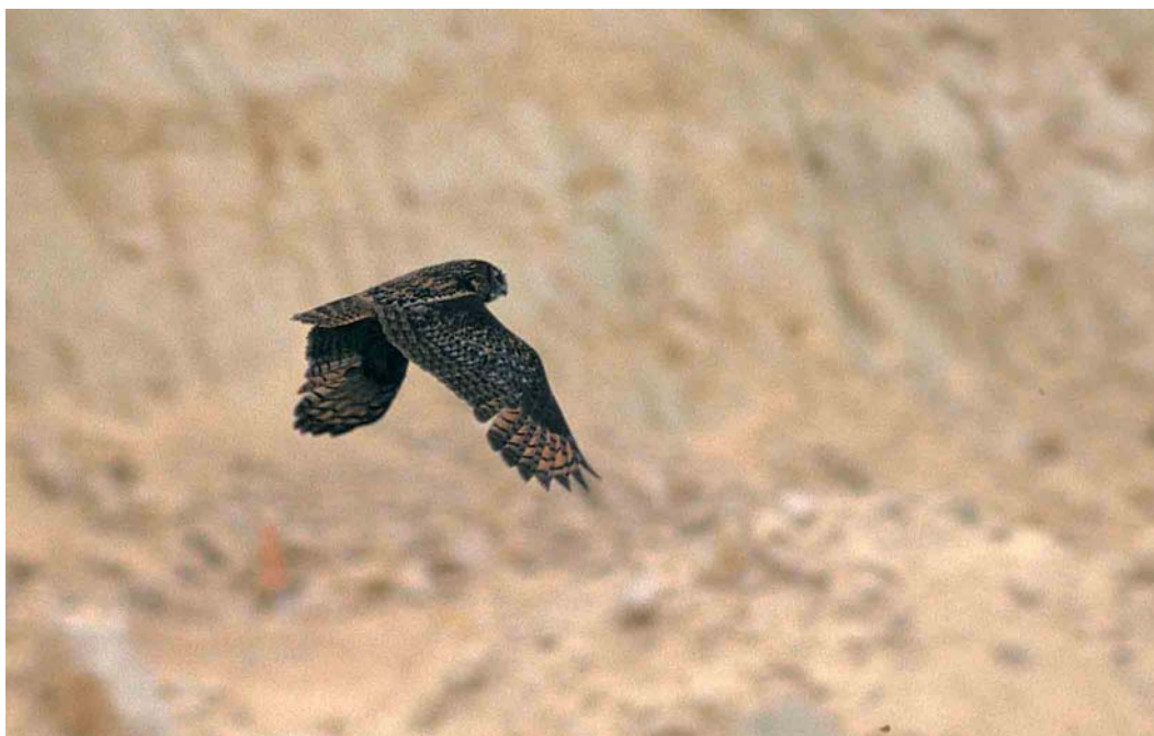
260 Eurasian Eagle Owl / Oehoe Bubo bubo , St Pietersberg, Maastricht, Limburg, 5 June 1999

'intermedius'-type birds is an identification pitfall, and future investigations may well lead to the conclusion that autumn adults can not be safely identified in the field. In that case, all records of adults need to be reviewed.