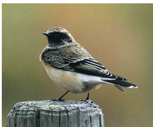
264 Radde's Warbler / Raddes Boszanger Phylloscopus schwarzi , Korverskooi, Texel, Noord-Holland, 8 October 1999 ( Arend Wassink ) 265 Western Bonelli's Warbler / Bergfluits Phylloscopus bonelli , Snoekebos, Kennemerduinen, Noord-Holland, 2 May 1999 ( Arnoud B van den Berg ) 266 Citrine Wagtail / Citroenkwikstaart Motacilla citreola , female, Katwijk aan Zee, Zuid-Holland, 7 May 1999 ( René van Rossum ) 267 Greater Short-toed Lark / Kortteenleeuwerik Calandrella brachydactyla , Uitdam, Waterland, Noord-Holland, 12 September 1999 ( Lucien Davids ) 268 Pied Wheatear / Bonte Tapuit Oenanthe pleschanka , first-winter female, Nederweert, Limburg, 10 November 1999 ( Theo Bakker/Cursorius ) 269 Pied Wheatear / Bonte Tapuit Oenanthe pleschanka , first-winter male, De Slufter, Texel, Noord-Holland, October 1999 ( Erik Menkveld )