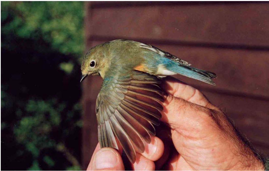
261 Red-flanked Bluetail / Blauwstaart Tarsiger cyanurus , first-winter male, Kroonspolders, Vlieland, Friesland, 11 October 1999 262 Red-spotted Bluethroat / Roodsterblauwborst Luscinia svecica svecica , Veendam, Groningen, 27 June 1999 263 Pine Bunting / Witkopgors Emberiza leucocephalos , first-winter female, Castricum, Noord-Holland, 8 November 1999