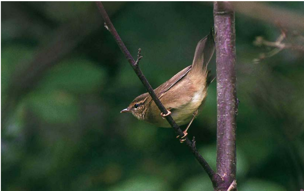
343 Radde's Warbler / Raddes Boszanger Phylloscopus schwarzi , Bomenland, Vlieland, Friesland, 11 October 1998