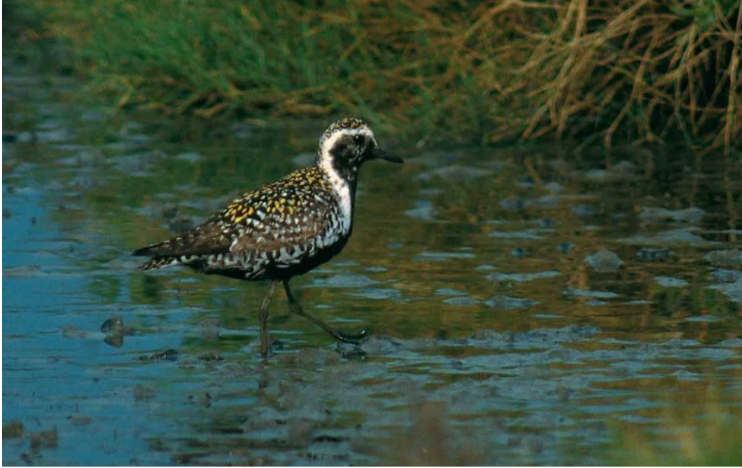
332 Pacific Golden Plover / Aziatische Goudplevier Pluvialis fulva , De Putten, Schoorl, Noord-Holland, 23 July 1998 (René Pop)