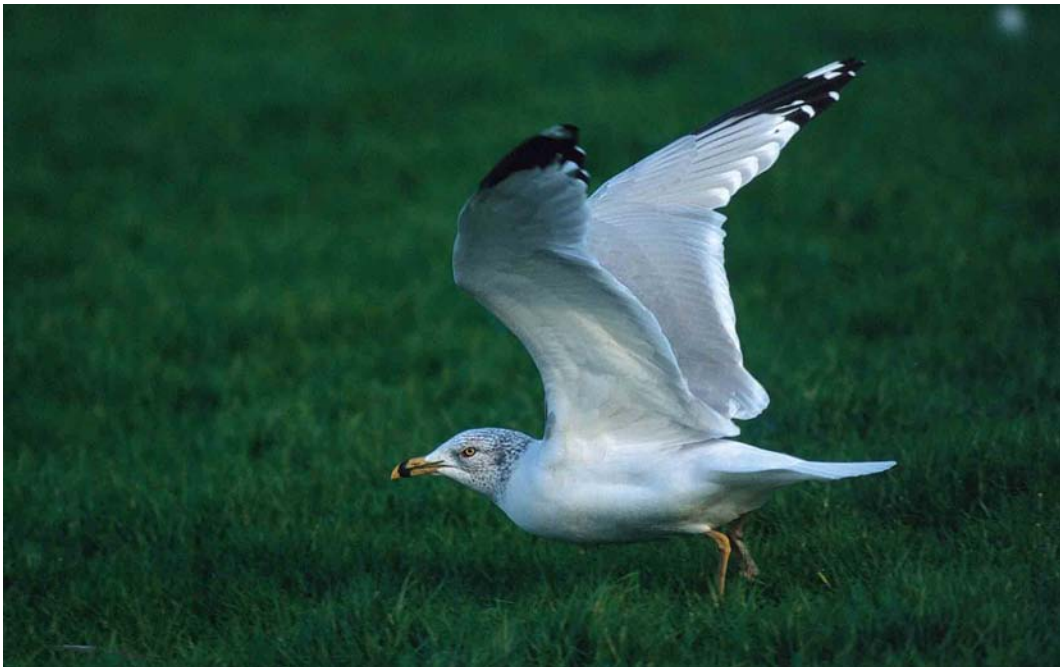
333 Ring-billed Gull / Ringsnavelmeeuw Larus delawarensis , adult male, Goes, Zeeland, 20 January 1998