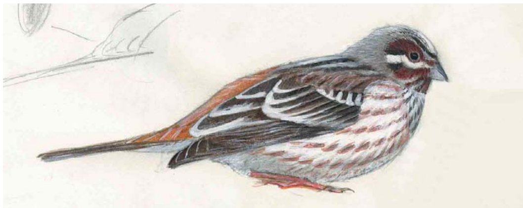
FIGURE 2 Pine Bunting / Witkopgors Emberiza leucocephalos , male, Kooioerdstuijdijk, Ameland, Friesland, March 1998

* Lammergeier / Lammergier Gypaetus barbatus 12-19 May, Den Haag , Zoetermeer , Katwijk and Noordwijk , Zuid-Holland, and Zandvoort , Bloemendaal , Julianadorp , Den Helder , Texel and Broek in Waterland , Noord-Holland, first-summer female, photographed, videoed (Dutch Birding 20: 128, plate 80, 136, plate 98, 1998; van den Berg & Bosman 1999) (identification accepted; identified as a captive-bred bird named 'Gélas' (code BG 279) released in NP Mercantour, Alpes-de-Haute-Provence/Alpes-Maritimes, France, in