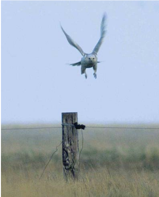
330 Gyr Falcon / Giervalk Falco rusticolus , immature, white morph, Schiermonnikoog, Friesland, 27 March 1998