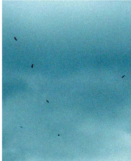
331 Eurasian Griffon Vultures / Vale Gieren Gyps fulvus , Draaibrug, Zeeland, 25 June 1998 (M Renes)