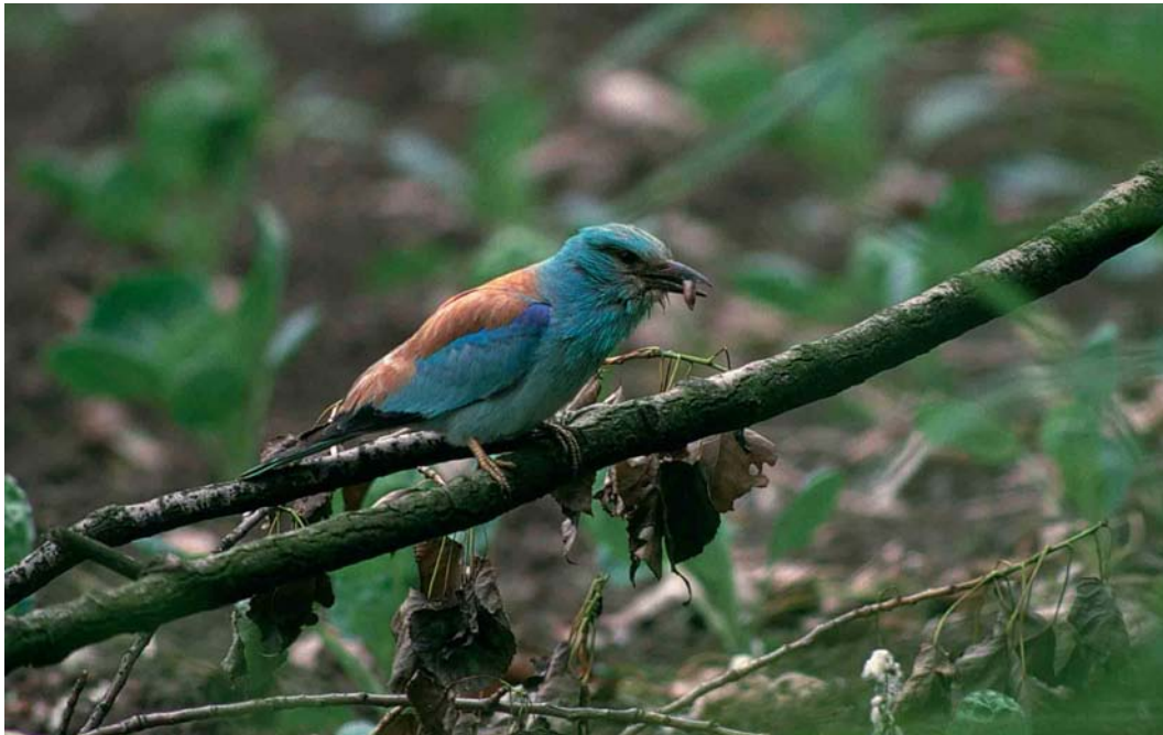
340 European Roller / Scharrelaar Coracias garrulus , Alblasterdam, Zuid-Holland, 19 June 1998 (Hans Gebuis)