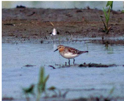
324 Black-winged Pratincole / Stepevorkstaartplevier Glaucopis trichoptera , adult, Hooge Zwaluwe, Noord-Brabant, 2 July 1998 ( Hans Gebuis ) 325 Black-winged Kite / Grijze Wouw Elanus caeruleus , Eierlandse Duinen, Texel, Noord-Holland, 30 March 1998 ( René van Rossum ) 326 Hutchins's Canada Goose / Hutchins's Canadese Gans Branta hutchinsii hutchinsii , Bandpolder, Friesland, 25 April 1998 ( Roef Mulder ) 327 White-headed Duck / Witkopeend Oxyura leucocephala , Nieuwe Diep, Amsterdam, Noord-Holland, 21 January 1998 ( Arnoud B van den Berg ) 328 Terek Sandpiper / Terekruiter Xenus cinereus , adult, Camperduin, Noord-Holland, 10 October 1998 ( Jan den Hertog ) 329 Red-necked Stint / Roodkeelstrandloper Calidris ruficollis , adult, Oud-Beijerland, Zuid-Holland, 4 July 1998 ( Hans Gebuis )