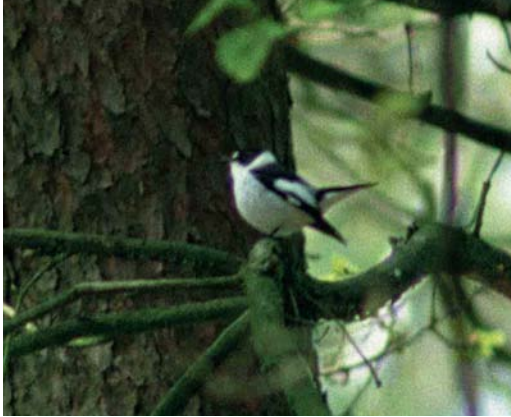
344 Collared Flycatcher / Withalsvliegenvanger Ficedula albicollis , adult male, Doorn, Utrecht, 4 May 1998