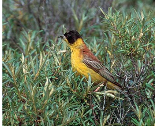
345 Black-headed Bunting / Zwartkopgors Emberiza melanocephala , adult male, Castricum aan Zee, Castricum, Noord-Holland, 21 June 1998 (Jan van Holten)

28 September, juvenile, West-Terschelling, Terschelling , Friesland (P W Logtmeijer, F Dorèl, R Vlek). 1997 10-12 October, Oost-Vlieland, Vlieland , Friesland, two (one on 10 October), juvenile, photographed (G J ter Haar, F Majoor, M Berlijn et al).