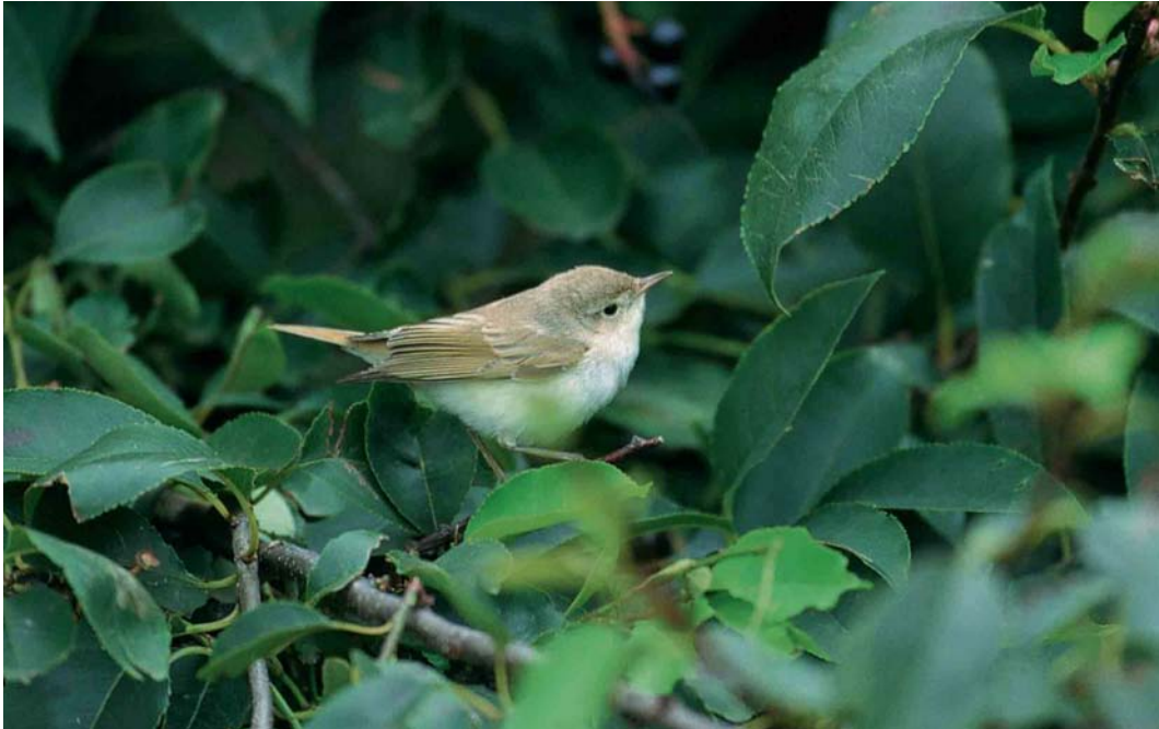
342 Western Bonelli's Warbler / Bergfluits Phylloscopus bonelli , De Cocksdorp, Texel, Noord-Holland, 15 September 1998