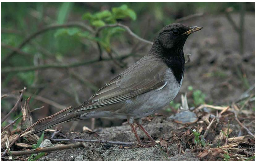
341 Black-throated Thrush / Zwartkeellijster Turdus ruficollis atrogularis , adult male, West-Terschelling, Terschelling, Friesland, 13 April 1998 (Eric Koops)