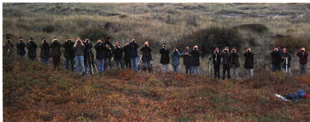
114 Central European Eurasian Treecreeper / Kortsnavelboomkruiper Certhia familiaris macrodactyla , Vijlenerbos, Limburg, 3 April 1994 (Max Berlijn) 115 Great Spotted Cuckoo / Kuifkoekoek Clamator glandarius , first-summer, Zuidlaardermeer, Groningen, 10 April 1994 (Eric Koops) 116 Hume's Yellow-browed Warbler / Humes Blackoning Phylloscopus humei , Lauwersoog, Groningen, 11 November 1994 (Koen van Dijken/Cursorius) 117 Dusky Warbler / Bruine Boszanger Phylloscopus tuscatus , Katwijk aan Zee, Zuid-Holland, 3 November 1994 (René van Rossum) 118 Birders at Dusky Warbler / vogelaars bij Bruine Boszanger Phylloscopus tuscatus , Hargen aan Zee, Noord-Holland, October 1994 (Rudi Otiereins)