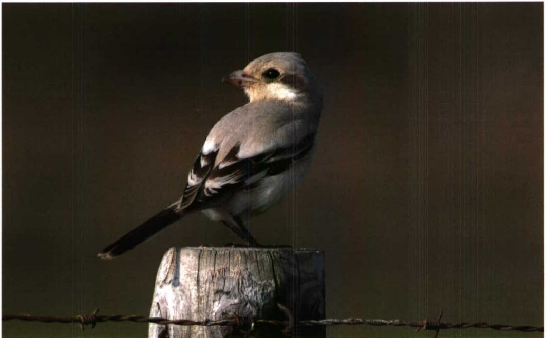
107 Steppe Grey Shrike / Steppeklapekster Lanius meridionalis pallidirostris , De Cocksdorp, Texel, Noord-Holland, 22 September 1994