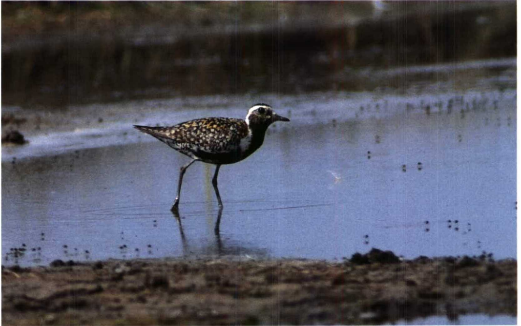
106 Pacific Golden Plover / Aziatische Goudplevier Pluvialis fulva , Petten, Noord-Holland, 24 July 1994 (Arnoud B van den Berg)