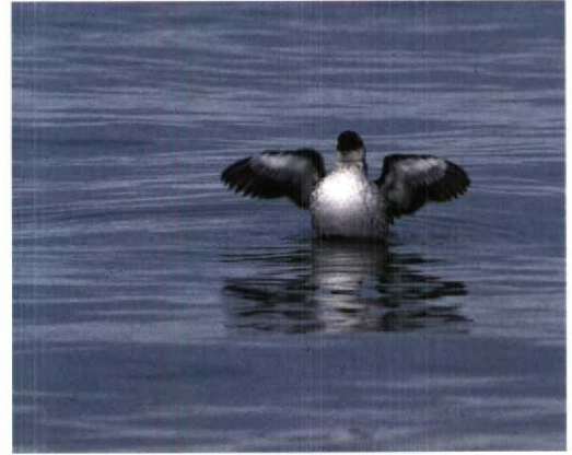
110 Buff-breasted Sandpiper / Blonde Ruiter Tryngites subruficollis , Julianadorp, Noord-Holland, 30 August 1994 (Arnoud B van den Berg) 111 American Golden Plover / Amerikaanse Goudplevier Pluvialis dominica , Texel, Noord-Holland, 20 October 1994 (Arnoud B van den Berg) 112 Cattle Egret / Koereiger Bubulcus ibis with Mute Swan / Knobbelzwaan Cygnus olor , Oostpolder, Groningen, August 1994 (Eric Koops) 113 Black Guillemot / Zwarte Zeekoet Cephus grylle , juvenile, Ilmuiden, Noord-Holland, 25 August 1994 (Arnoud B van den Berg)

American Wigeon Anas americana 14,2 UTRECHT Wijk bij Duurstede, 23-27 February, adult male (E Bos, A Schaftenaar, J J F J Jansen). NOORD-HOLLAND Spaarnwoude, 13-15 November, adult male (E B Ebels, G H Steinhaus, R Slaterus).