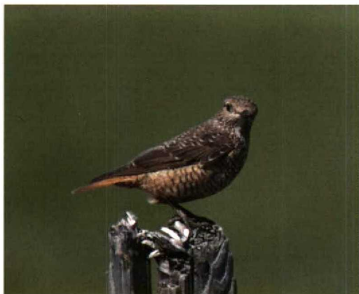
119 Rock Thrush / Rode Rotslijster Monticola saxatilis , Noordburen, Noord-Holland, May 1994 (Hans Gebuis)