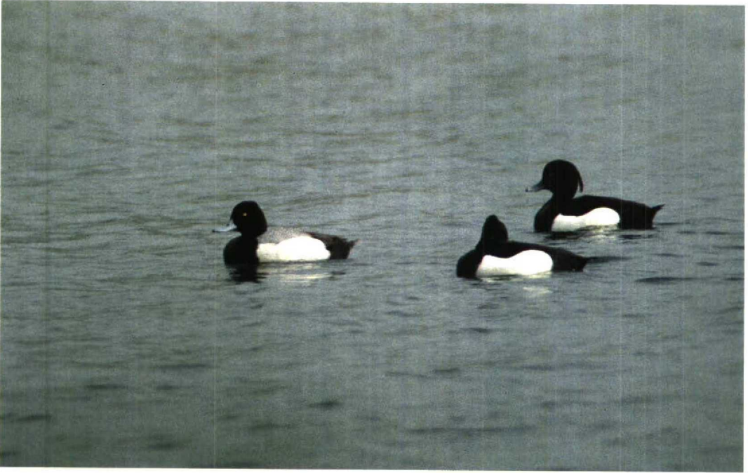
103 Lesser Scaup / Kleine Topper Aythya affinis with Tufted Ducks / Kuifeenden A. fuligula , males, Veere, Zeeland, December 1994 104 Lesser Canada Goose / Kleine Canadese Gans Branta canadensis hutchinsii/parvipes , adult, Workum, Friesland, 30 January 1994 105 King Eider / Koningseider Somateria spectabilis , first-winter female, Scheveningen, Zuid-Holland, 27 October 1994