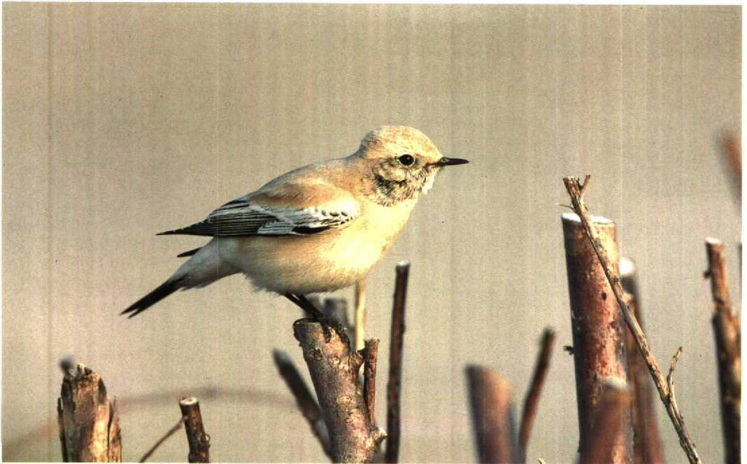
109 Desert Wheatear / Woestijntapuit Oenanthe deserti , Zandvoort, Noord-Holland, 9 October 1994 (René van Rossum)