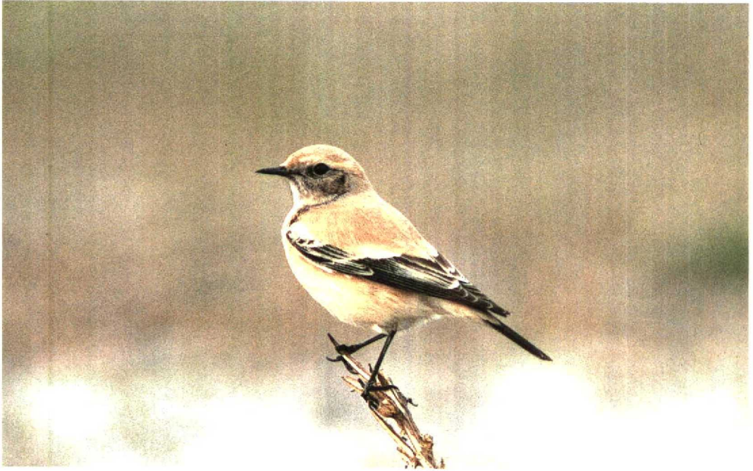
108 Desert Wheatear / Woestijntapuit Oenanthe deserti , Maasvlakte, Zuid-Holland, 6 November 1994 (Arnoud B van den Berg)