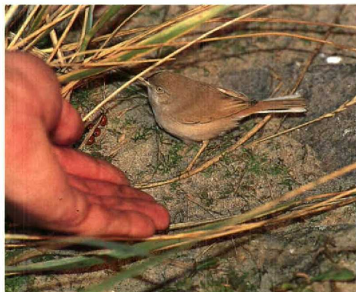
120 Desert Warbler / Woestijngrasmus Sylvia nana , Scheveningen, Zuid-Holland, 8 October 1994

(S Poley, A Wassink); Texel, 21 October (R M van Dongen, A Wassink).